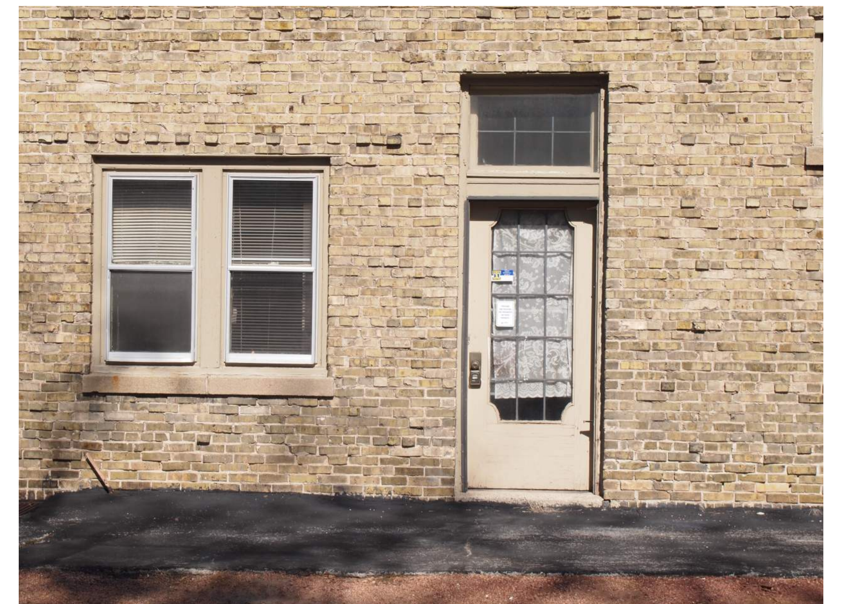
SOUTH ELEVATION PHOTOS