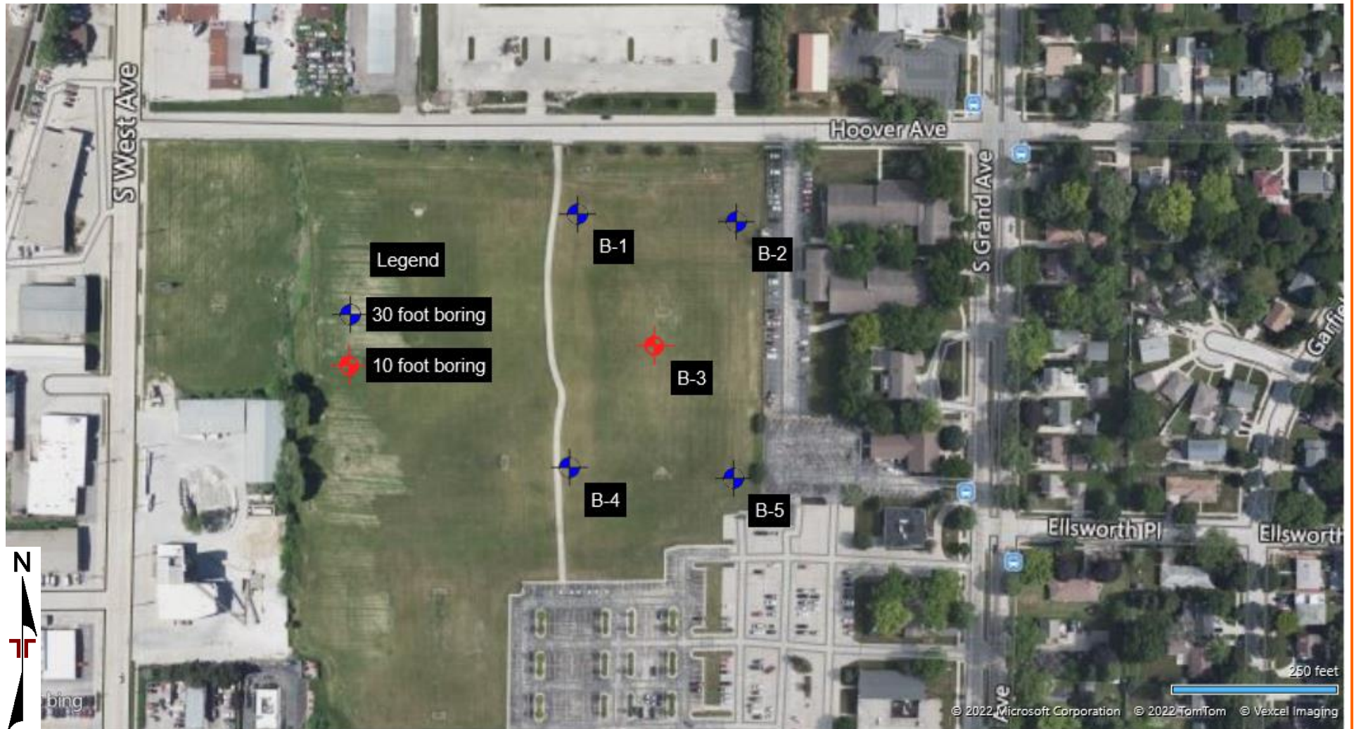
DIAGRAM IS FOR GENERAL LOCATION ONLY, AND IS NOT INTENDED FOR CONSTRUCTION PURPOSES