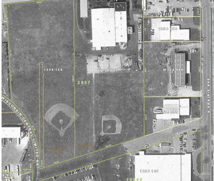
Waukesha County GIS – 2015 Aerial Photo