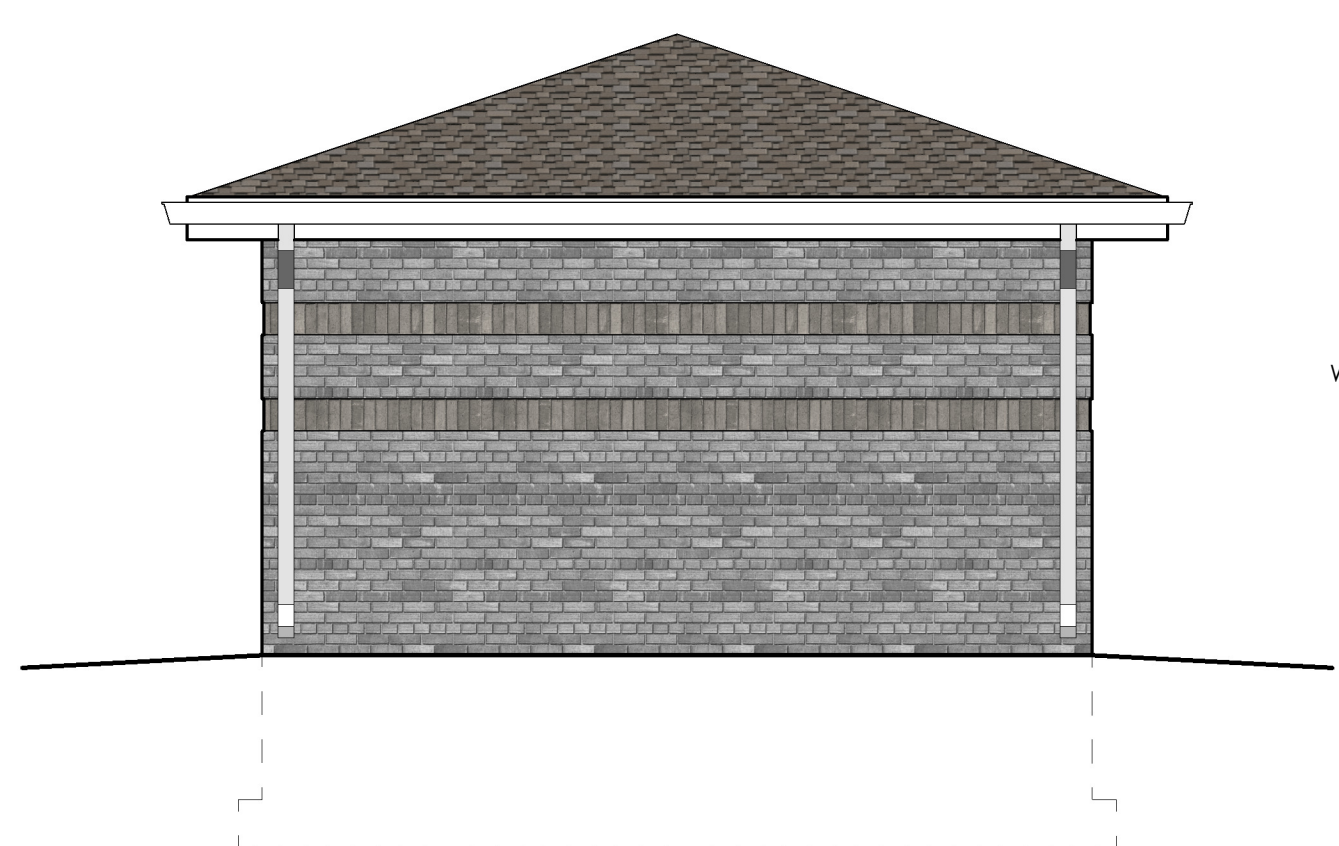
③ SOUTH ELEVATION 1/4" = 1'-0"