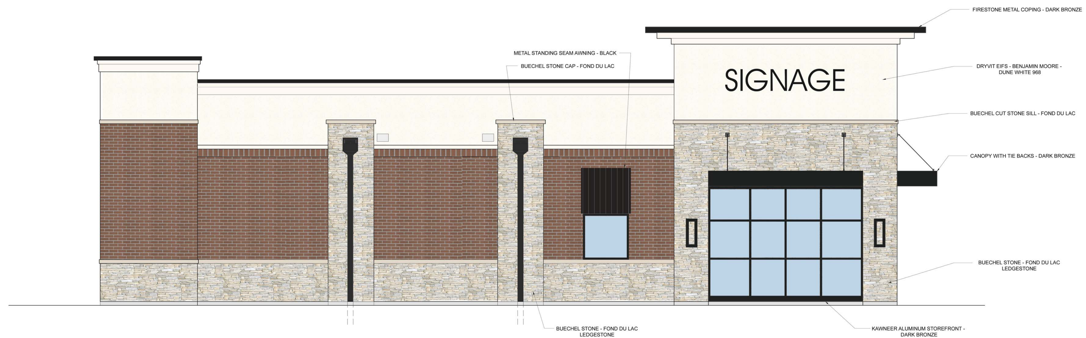
4 PRELIMINARY EAST ELEVATION SCALE: 1/4" = 1'-0"