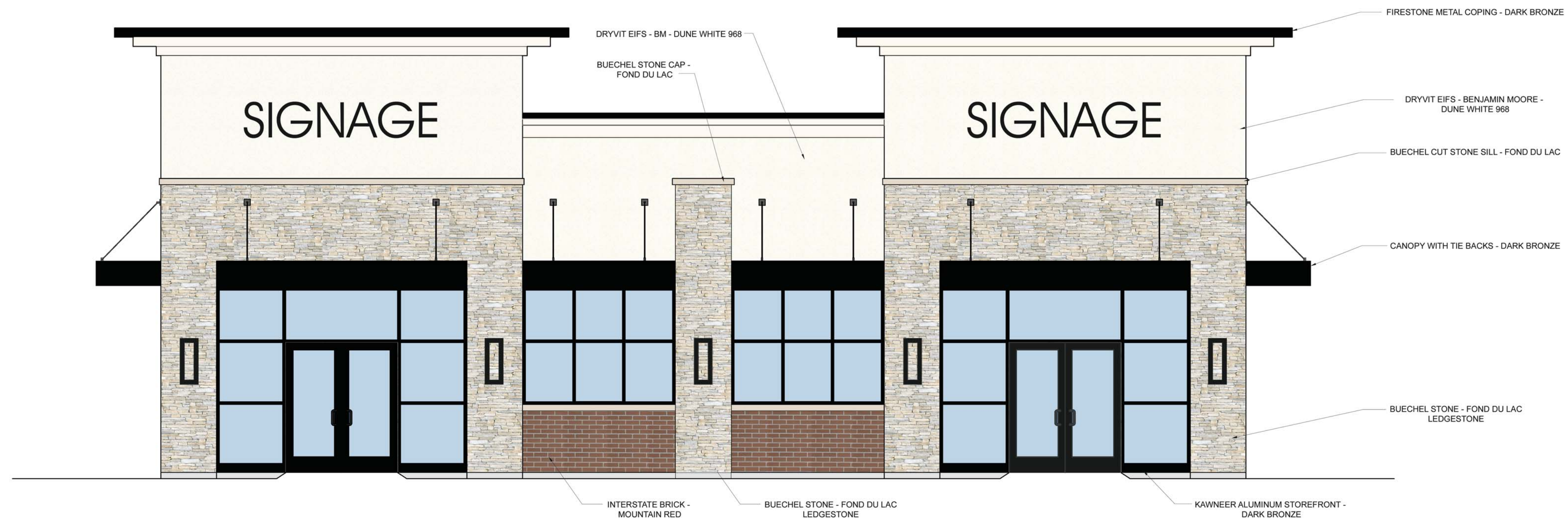
1 PRELIMINARY NORTH ELEVATION SCALE: 1/4" = 1'-0"

SEAL: THIS DOCUMENT IS NOT FOR CONSTRUCTION UNLESS THE ARCHITECT OR ENGINEER'S SIGNATURE AND SEAL APPEAR BELOW.