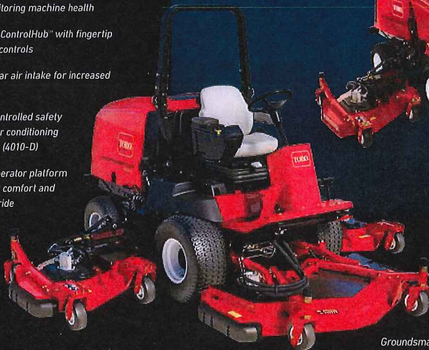
Groundsmaster ® 4010-D