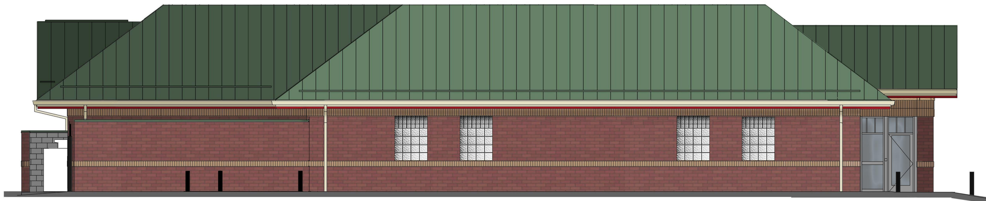
3 REAR ELEVATION