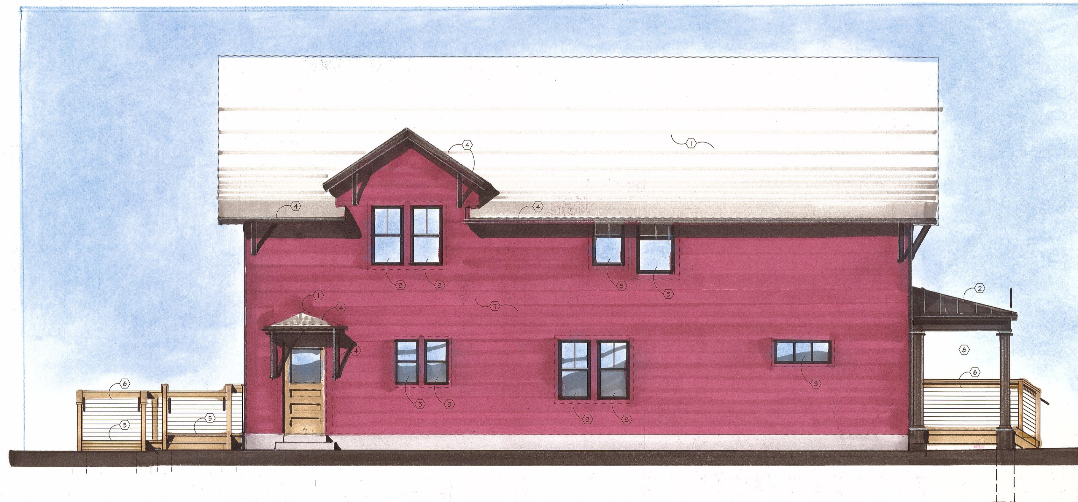
② EXISTING WEST ELEVATION 1/4" = 1'-0"