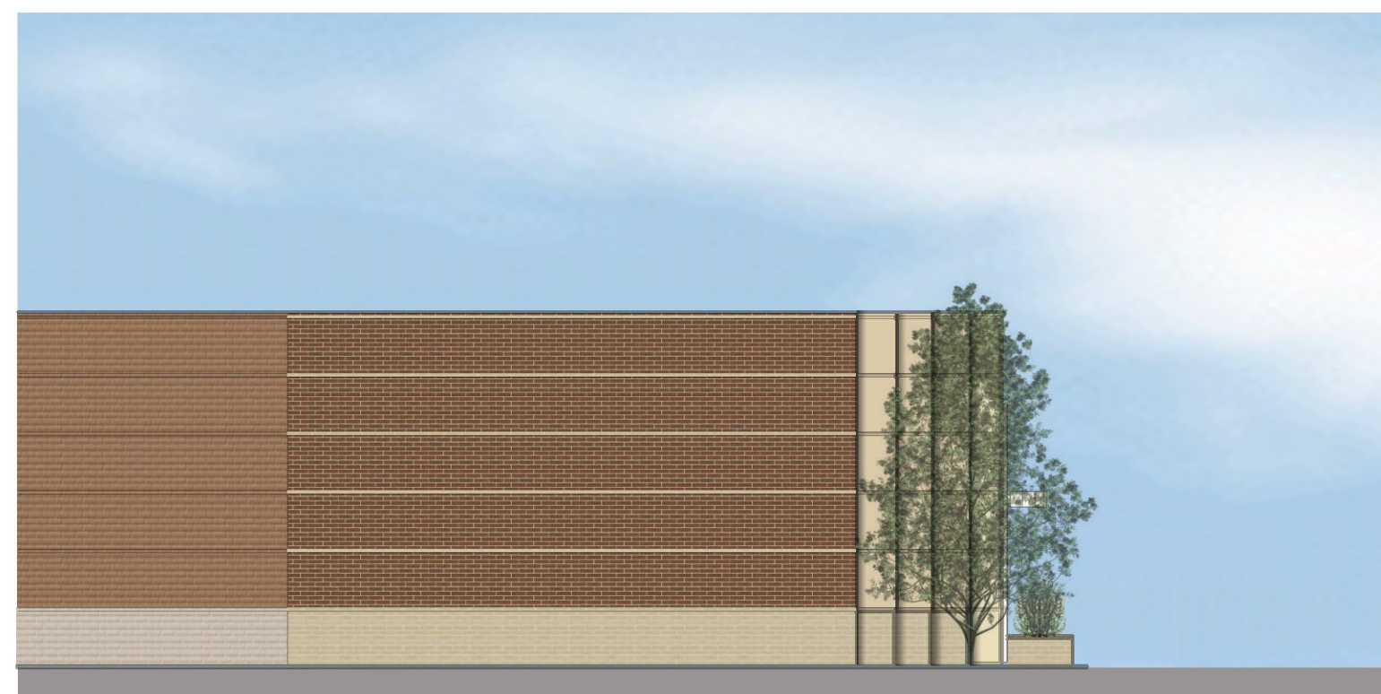
EXISTING PARTIAL LEFT SIDE ELEVATION