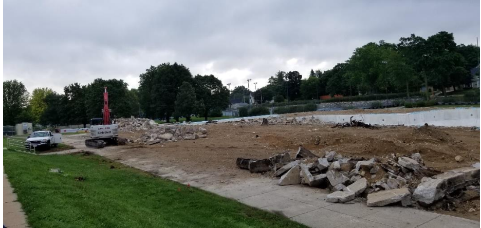
Figure 4-Buchner Pool Demo