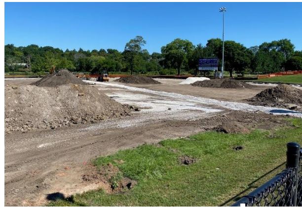
Figure 2-Artificial Turf Field Installation