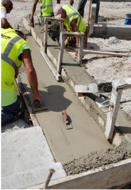
Figure 5-Barstow St Concrete Work