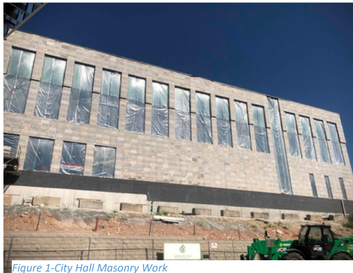
Figure 1-City Hall Masonry Work