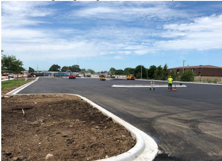
Figure 3-Banting and Mindiola Park Parking Lots and Heyer Park Tennis Court