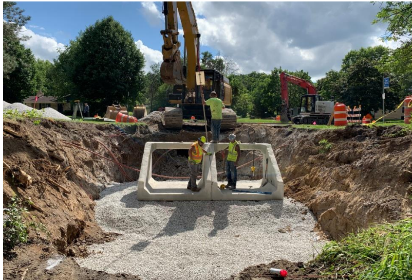
Figure 8-Storm Inlets at Rolling Ridge Dr.