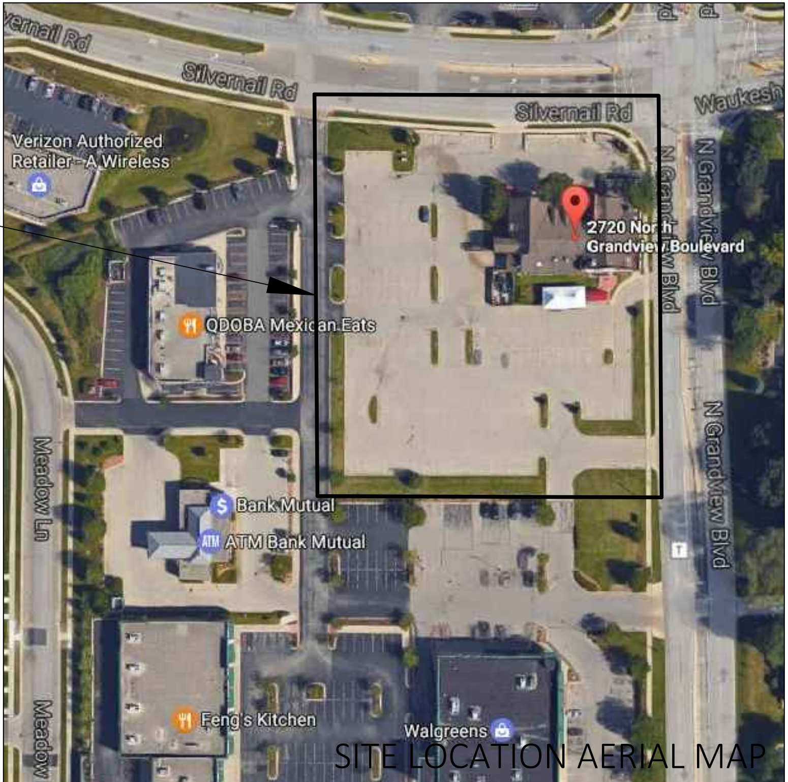
SITE LOCATION AERIAL MAP