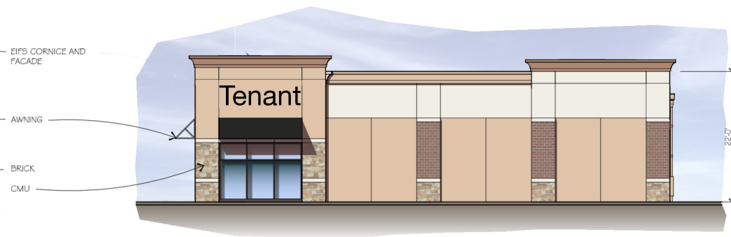
BUILDING E NORTH ELEVATION SCALE: 3/32"=1'-0" 5 A4.4