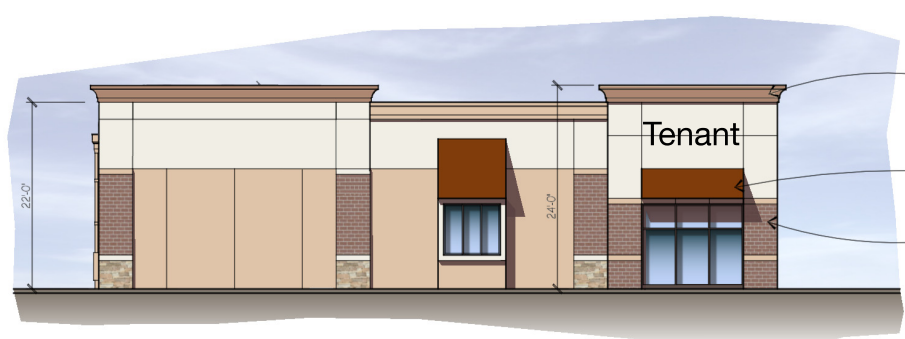
BUILDING F SOUTH ELEVATION SCALE: 3/32"=1'-0" 6 A4.4