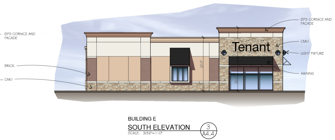
BUILDING E SOUTH ELEVATION SCALE: 3/32"=1'-0" 3 A4.4