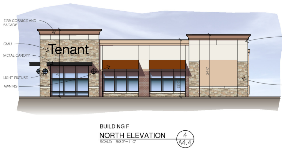
BUILDING F NORTH ELEVATION SCALE: 3/32"=1'-0" 4 A4.4