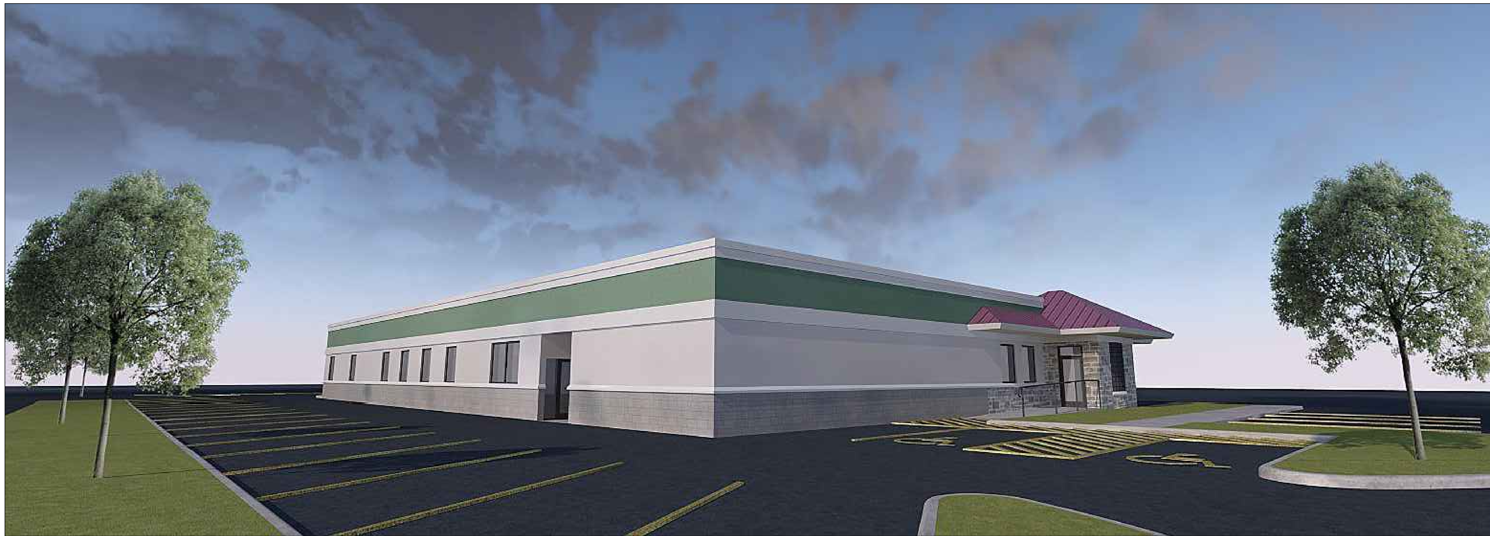
VIEW OF NORTHWEST CORNER FROM SERVICE ACCESS ROAD