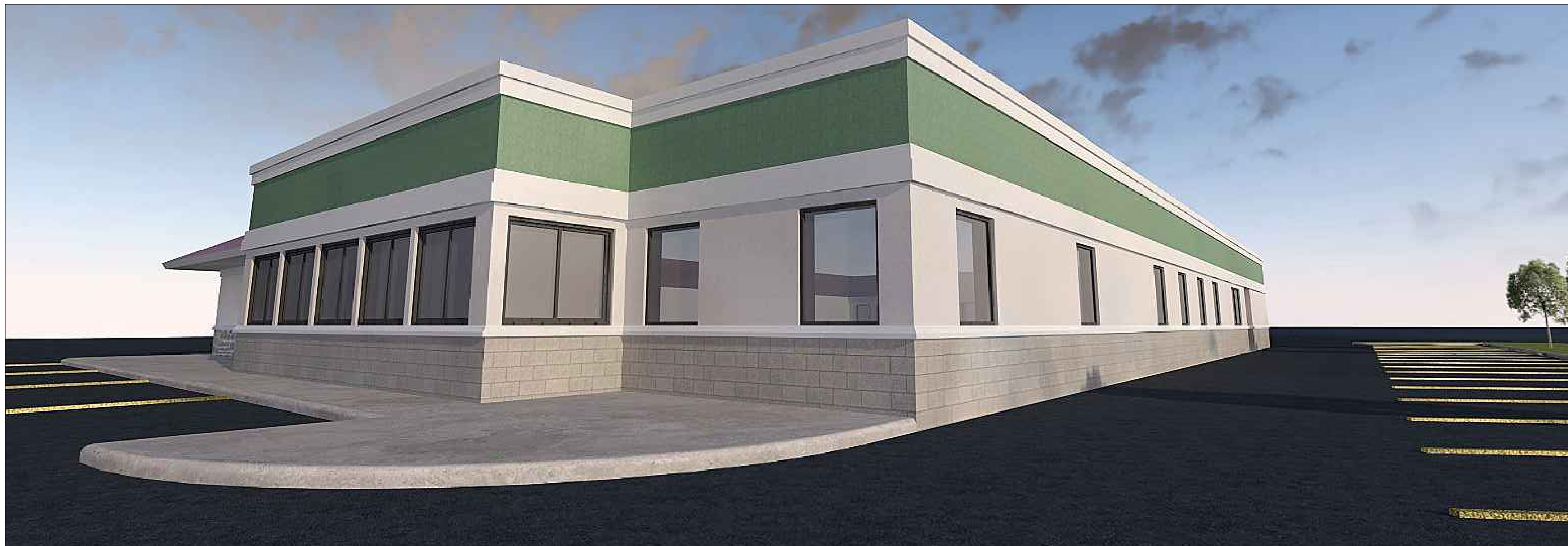
VIEW OF NORTHEAST CORNER FROM NORTH GRANDVIEW BOULEVARD

*PLAN COMMISSION REVIEW SET - (11-20-23)*