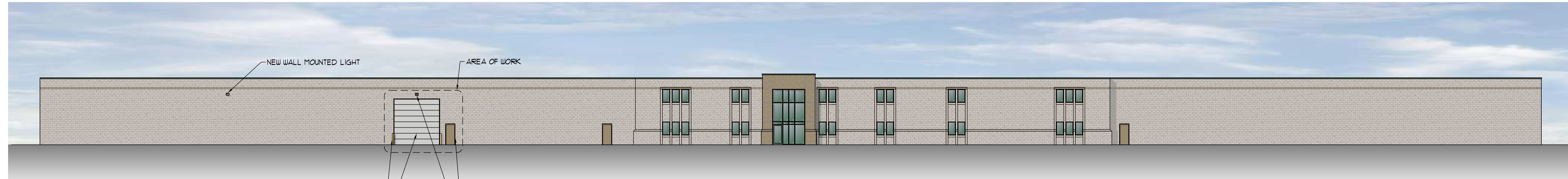
PROPOSED PHASE I SOUTH ELEVATION 2 SCALE: 1" = 20'