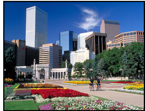
Denver Recreation Centers Needs Assessment