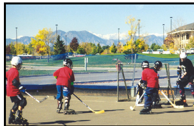
City and County of Broomfield