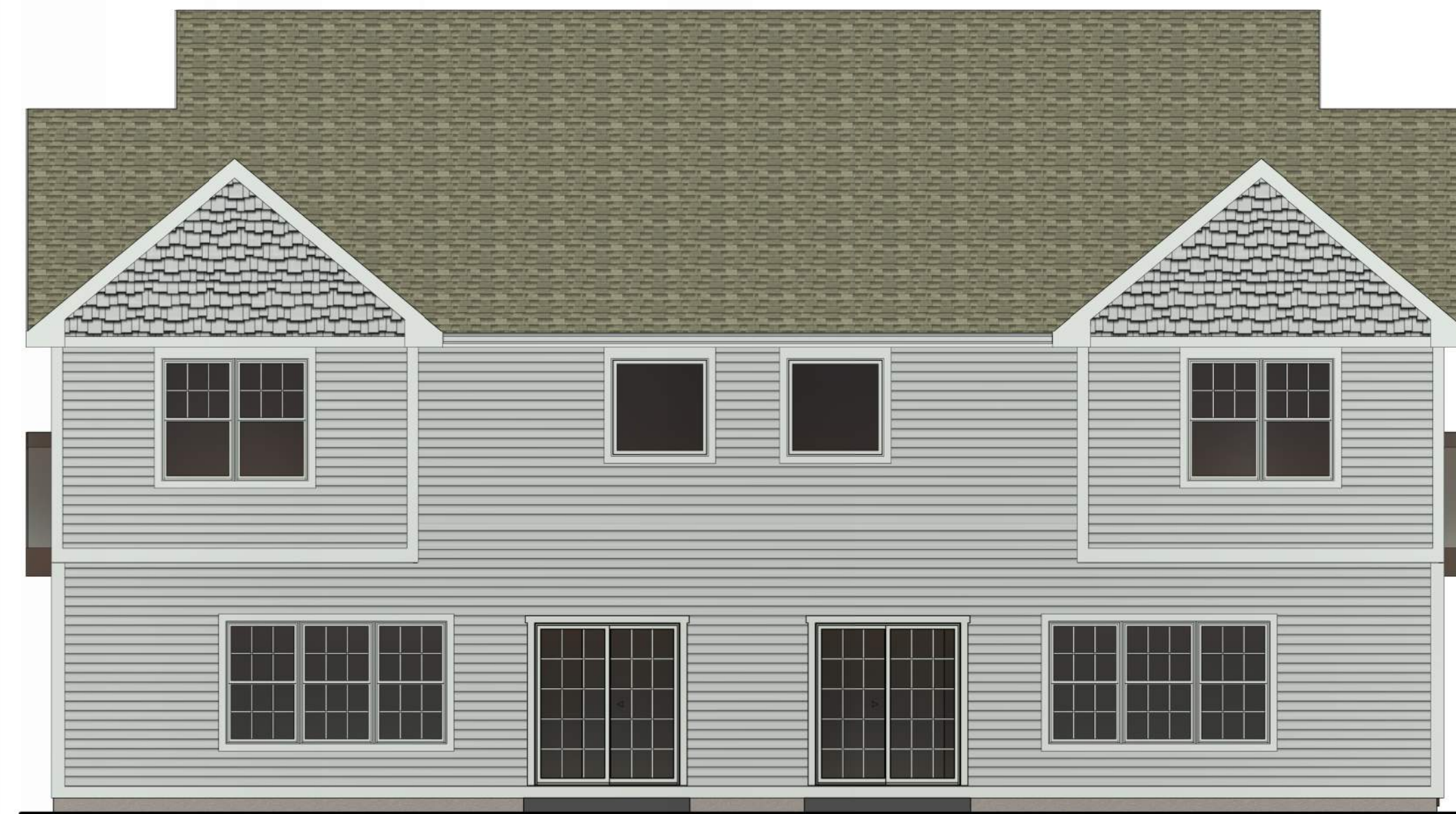
3 REAR ELEVATION 3/16" = 1'-0"