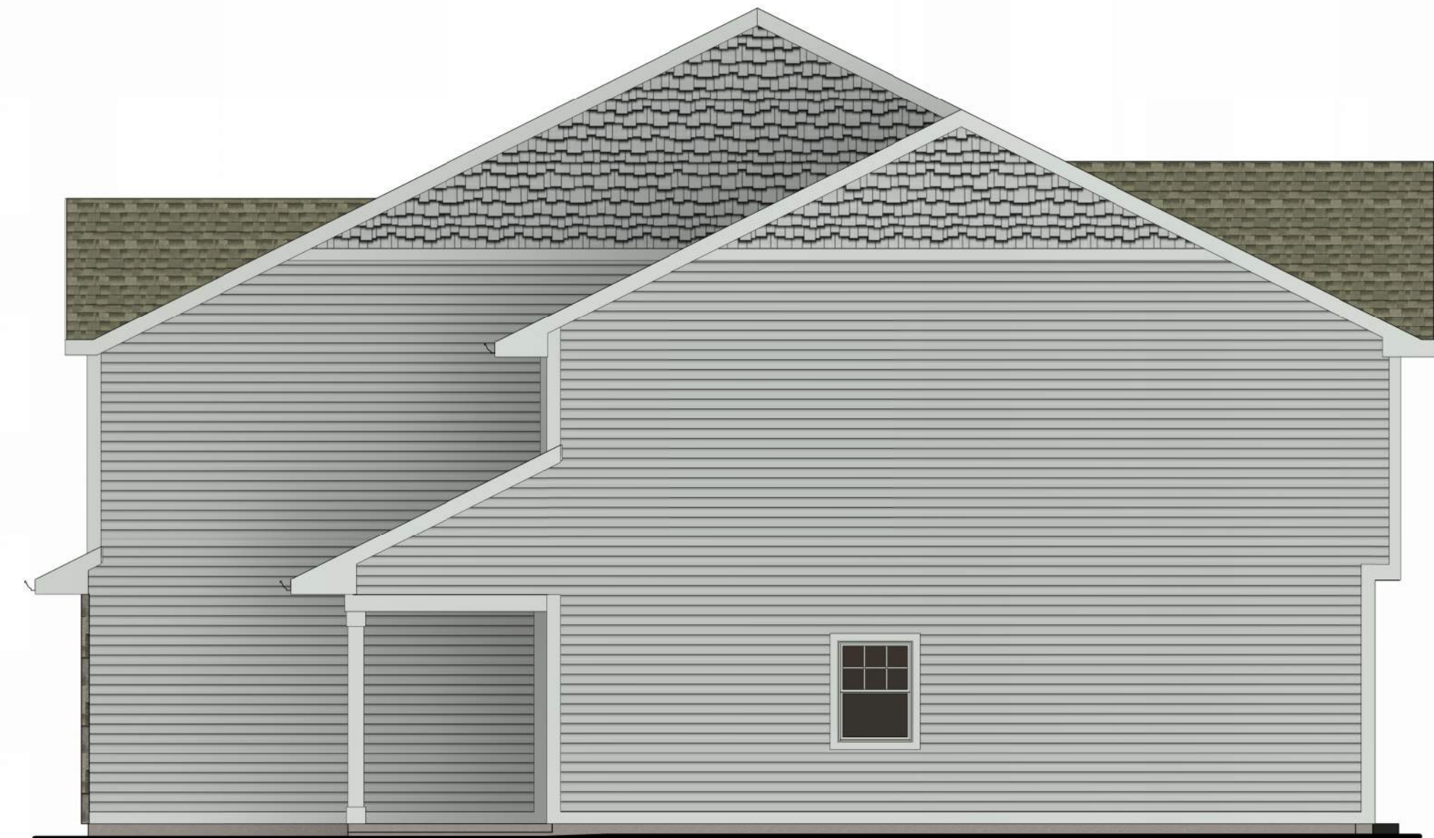
2 RIGHT SIDE ELEVATION 3/16" = 1'-0"