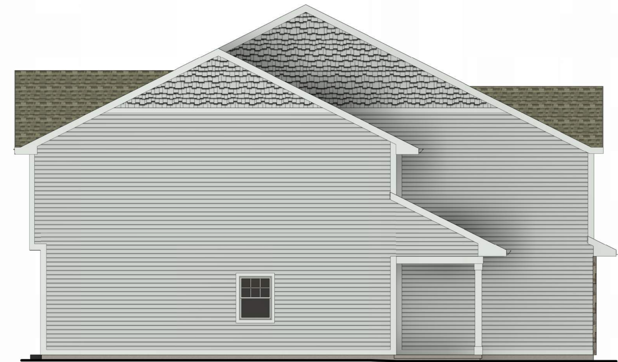
4 LEFT SIDE ELEVATION 3/16" = 1'-0"