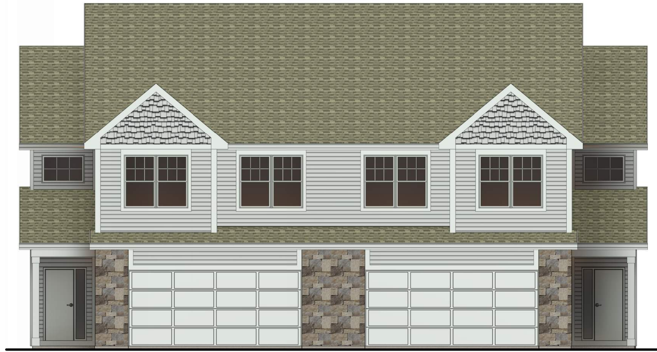
1 FRONT ELEVATION 3/16" = 1'-0"

ROOF SHINGLE 30 YEAR GAF TIMBERLINE SHINGLE - WEATHERWOOD