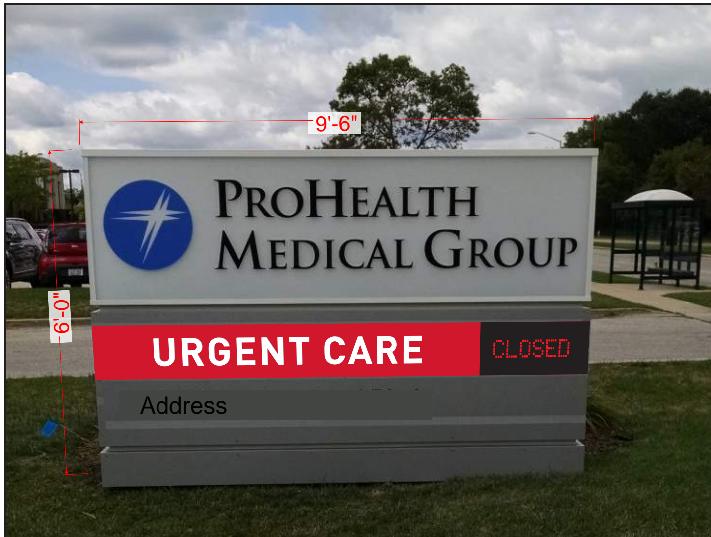
*Example sign shown for reference of general design intent- full design documentation to be formally submitted for review and approval