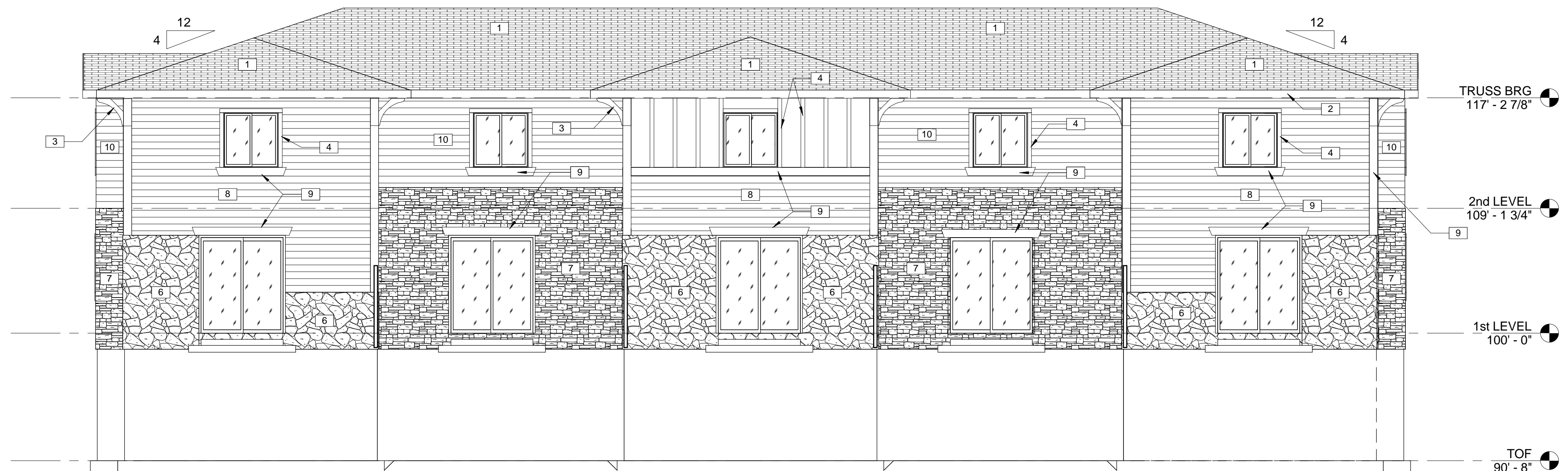
④ NORTH ELEVATION 3/16" = 1'-0"