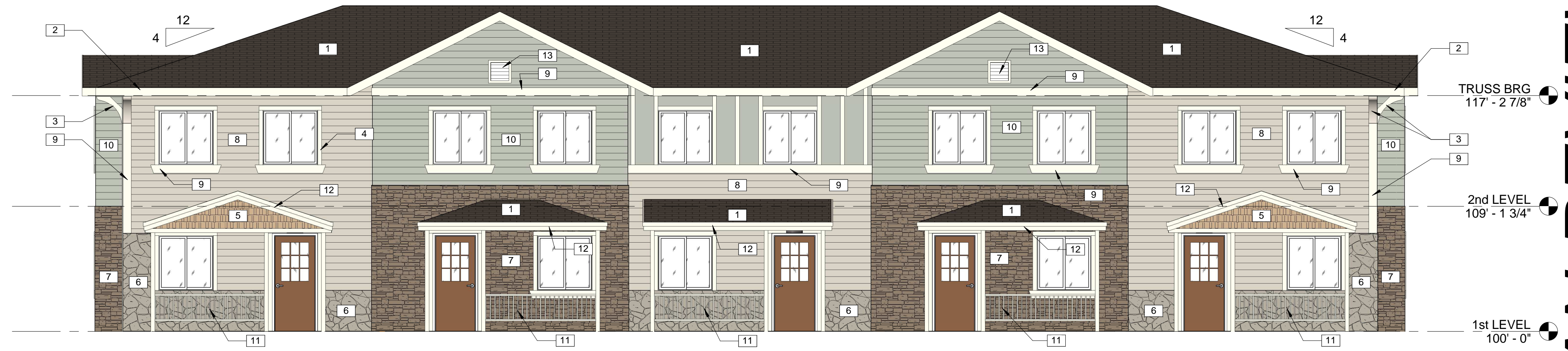
① SOUTH ELEVATION 3/16" = 1'-0"