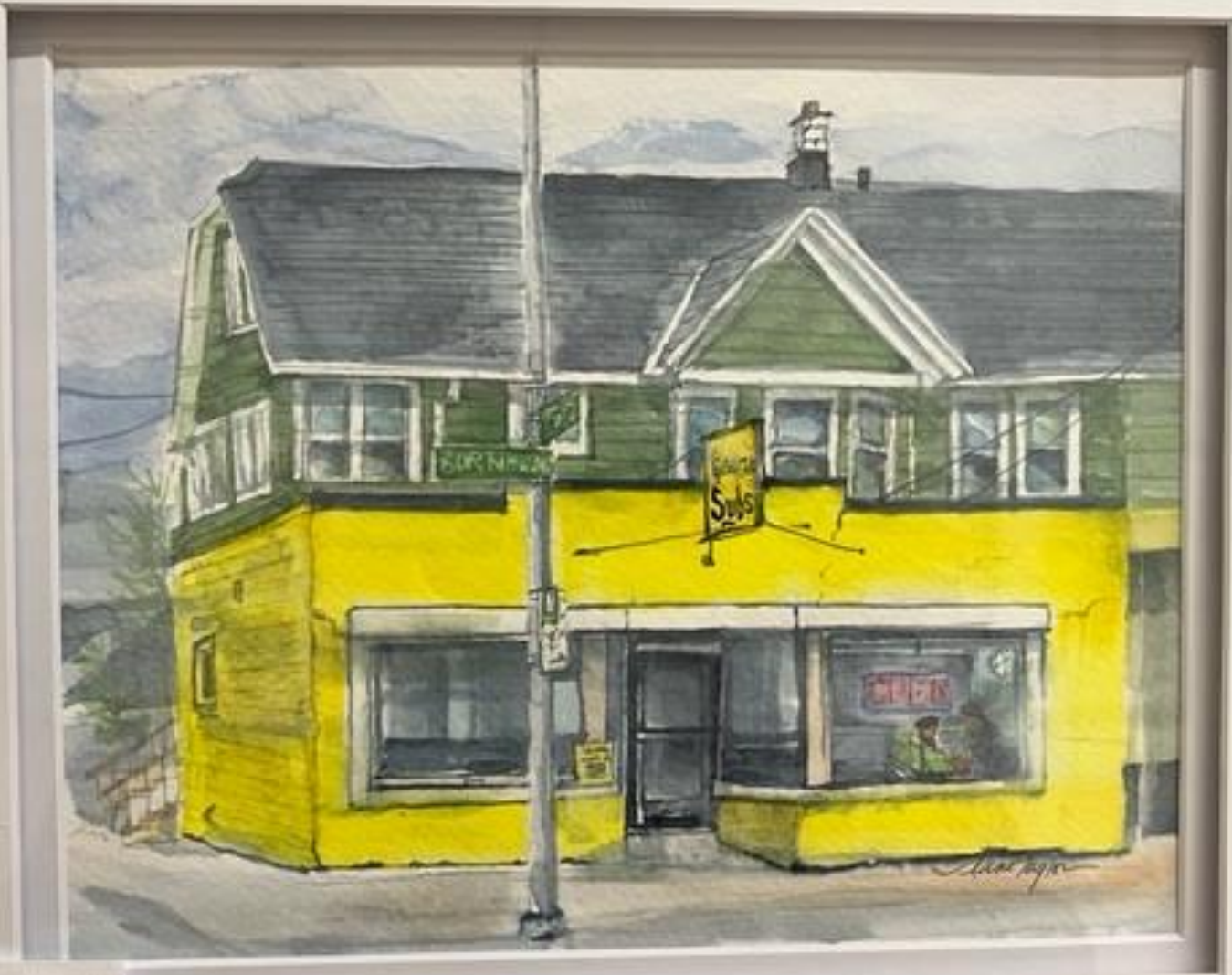
h Stories® series