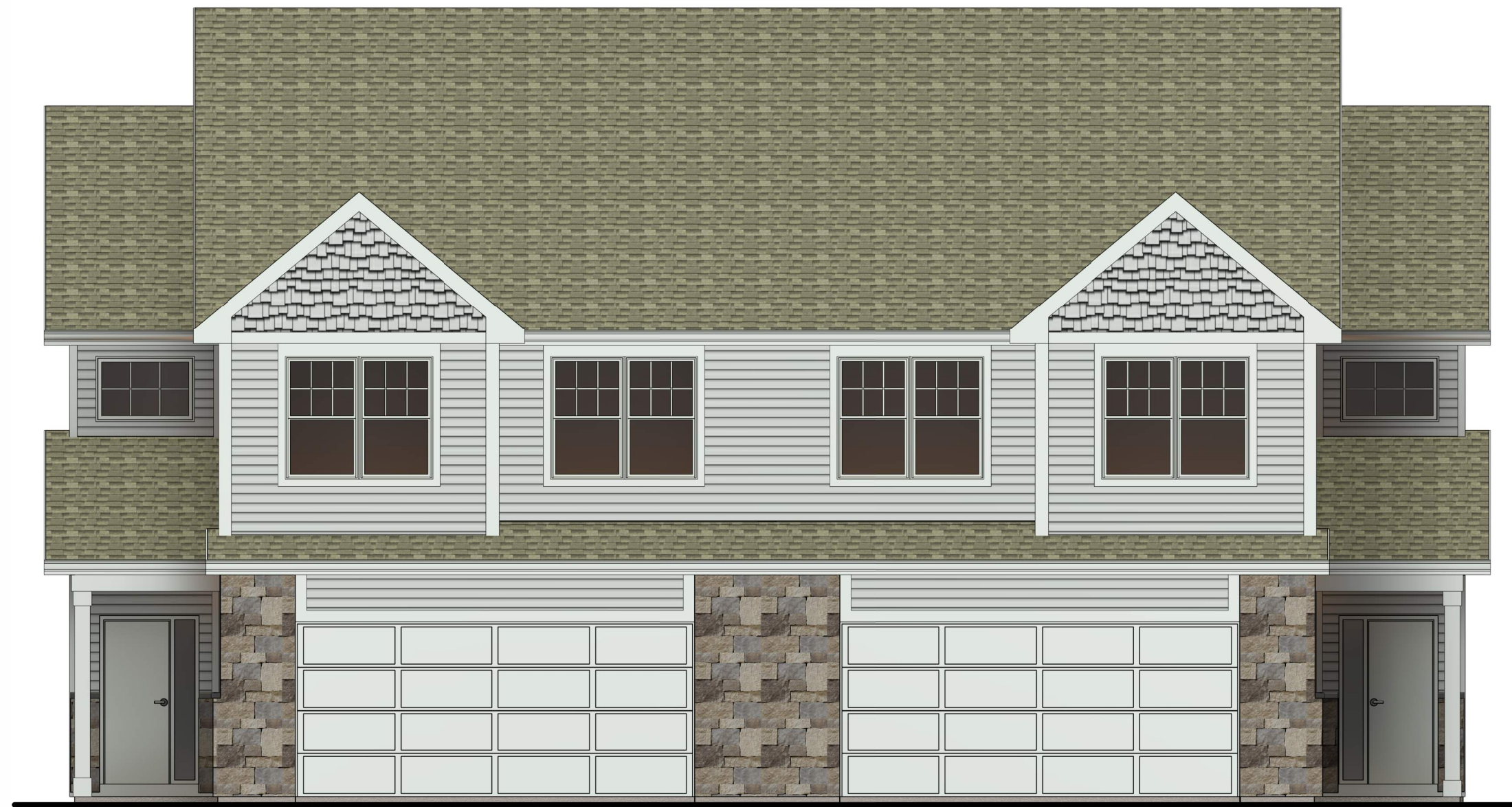
1 FRONT ELEVATION 3/16" = 1'-0"

ROOF SHINGLE 30 YEAR GAF TIMBERLINE SHINGLE - WEATHERWOOD