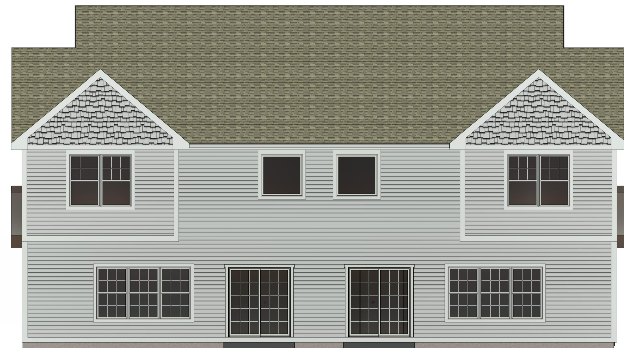
3 REAR ELEVATION 3/16" = 1'-0"