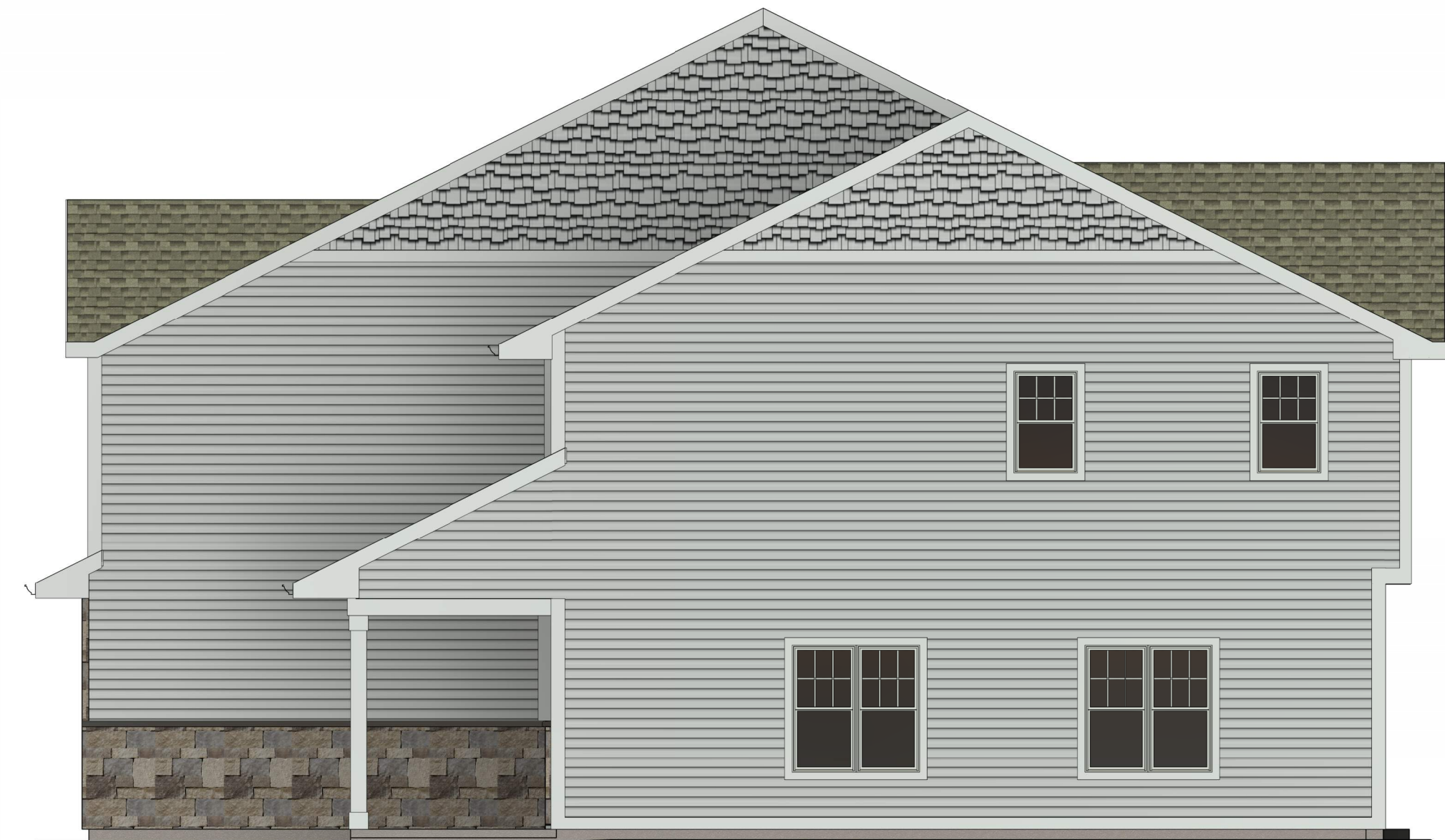
2 RIGHT SIDE ELEVATION 3/16" = 1'-0"