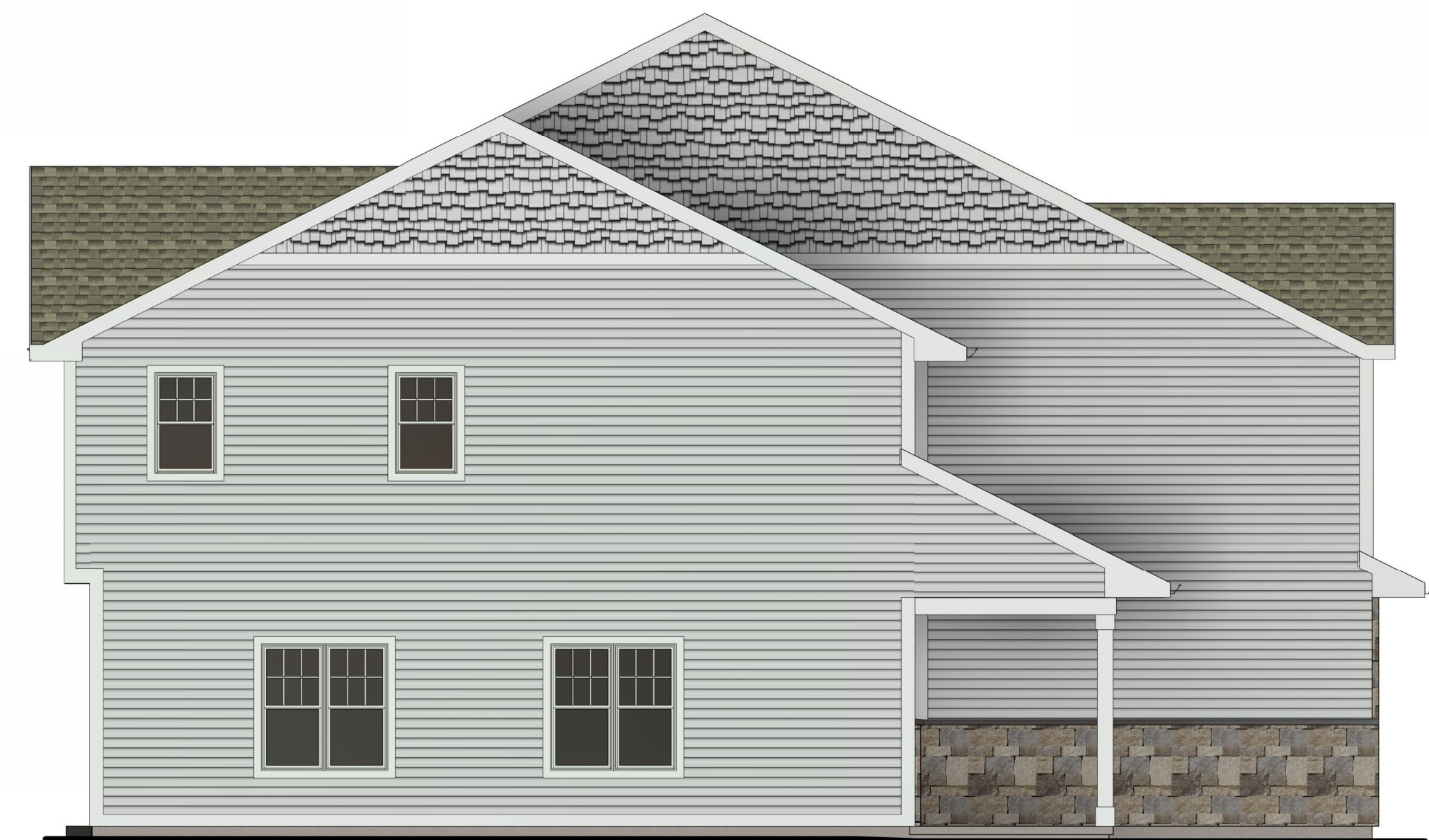
4 LEFT SIDE ELEVATION 3/16" = 1'-0"