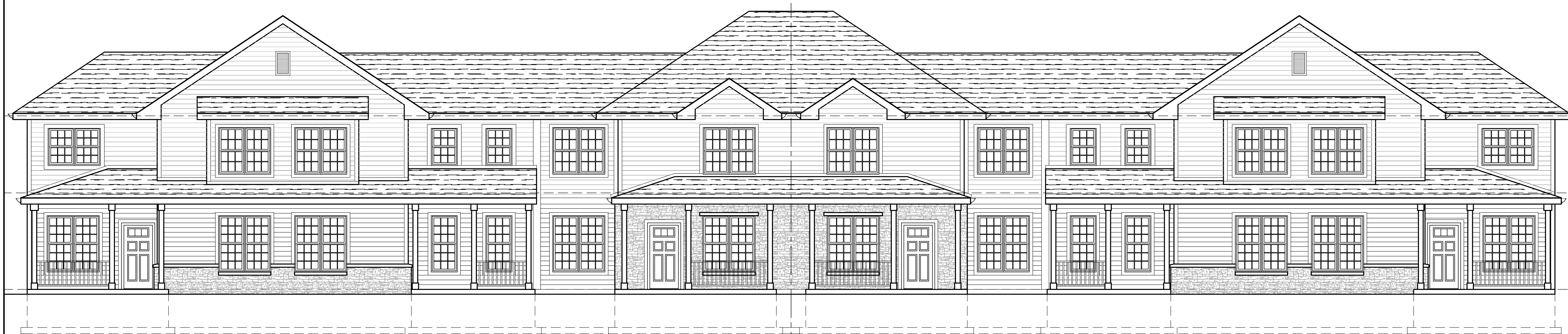
○ SOUTHEAST ELEVATION 3/16" = 1'-0"