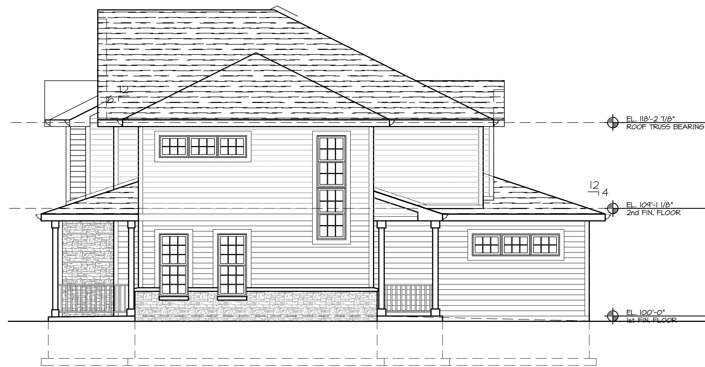
○ NORTHEAST ELEVATION 3/16" = 1'-0"