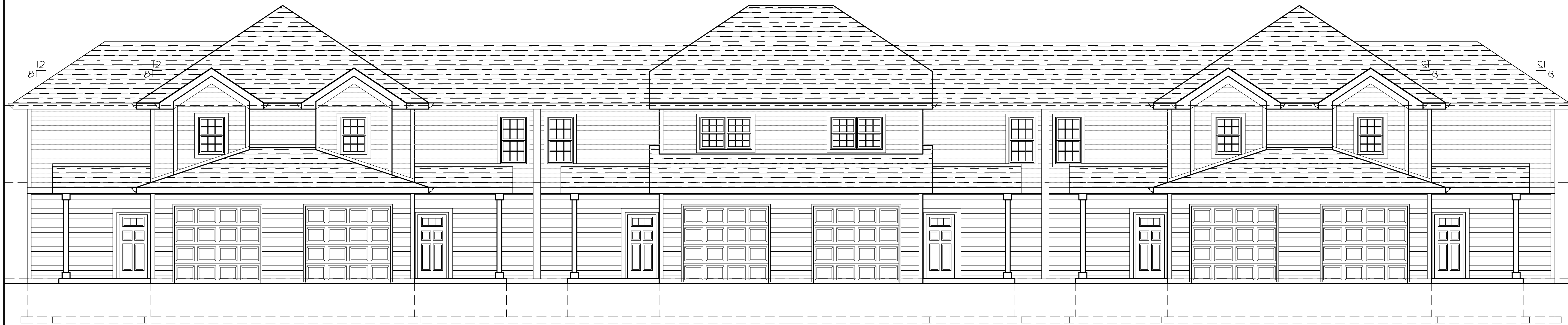
○ NORTHWEST ELEVATION 3/16" = 1'-0"