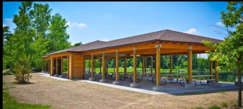
City of Waukesha Park Master Planning