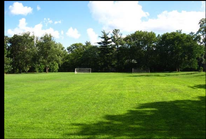
Flexible Recreation Space