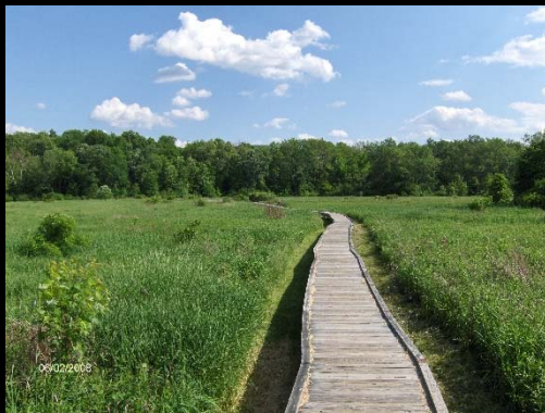
Boardwalk Over Wetlands