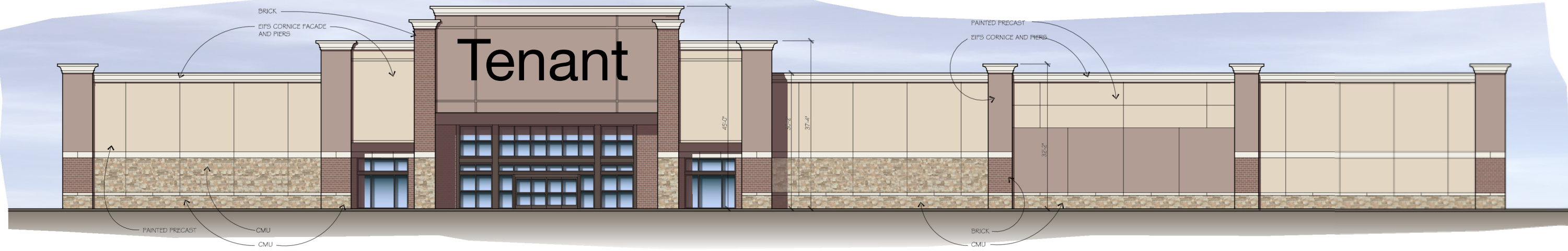
SOUTH ELEVATION SCALE: 3/32"=1'-0" 1 A4.1