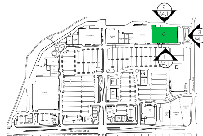
KEY PLAN SCALE: NTS