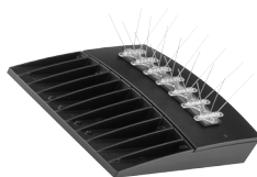
BSW - Bird-deterrent spikes