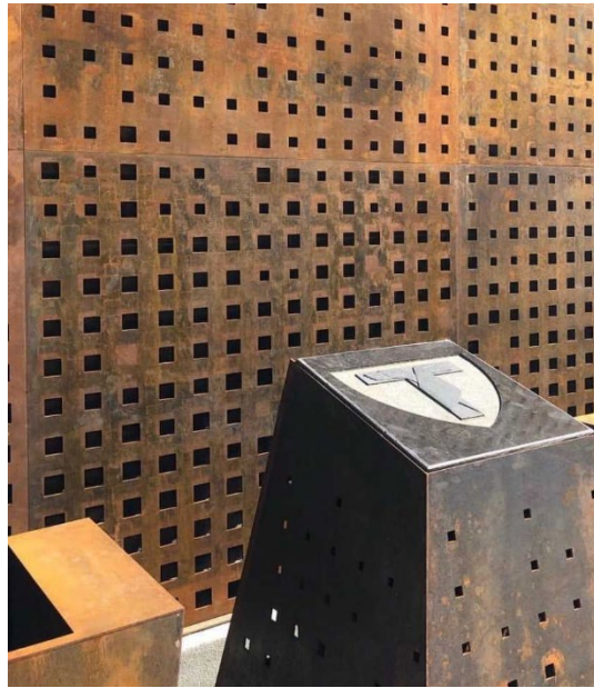
Pictured above: Work by Design Fugitives for the School Sisters of Saint Francis. The above picture illustrates the type of steel proposed for the totem-like structure for the sculpture. The steel becomes aged and weathered over time, which creates a feeling of permanence and history.