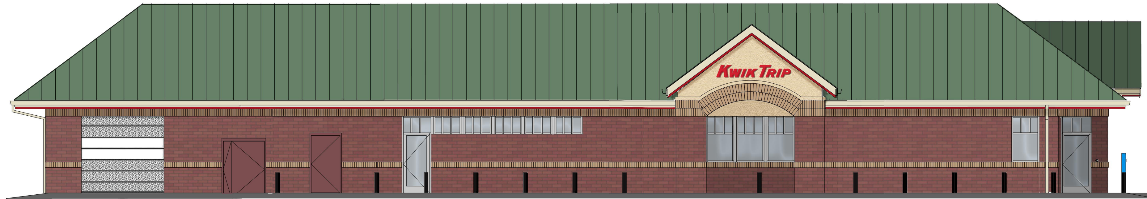
2 LEFT ELEVATION