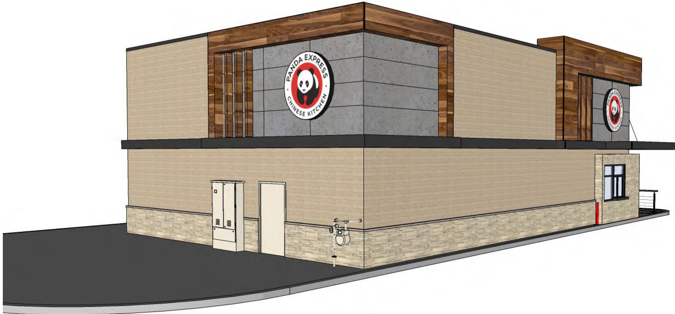
RENDER VIEW FACING NORTHEAST