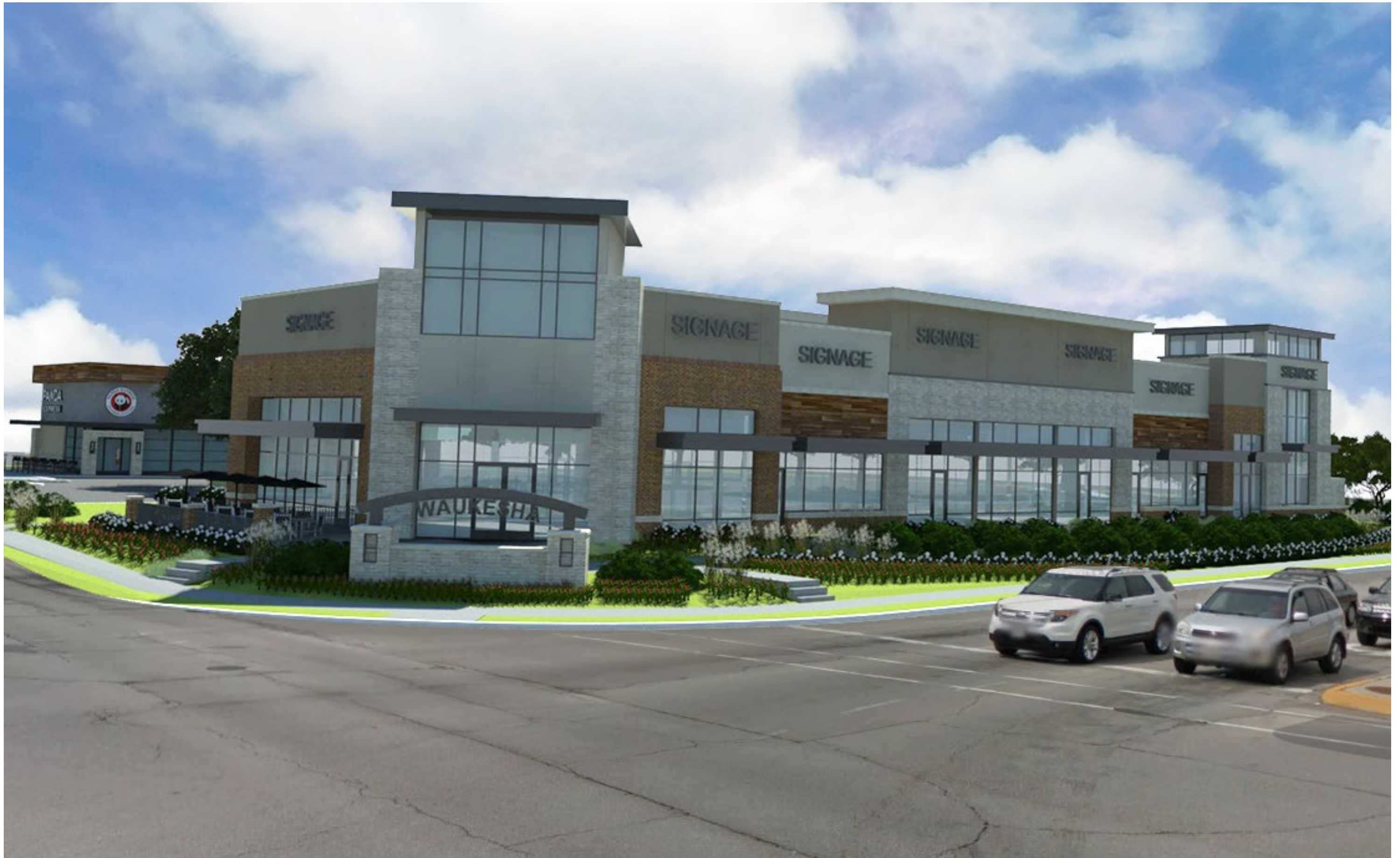
NORTHEAST VIEW FROM GRANDVIEW RD