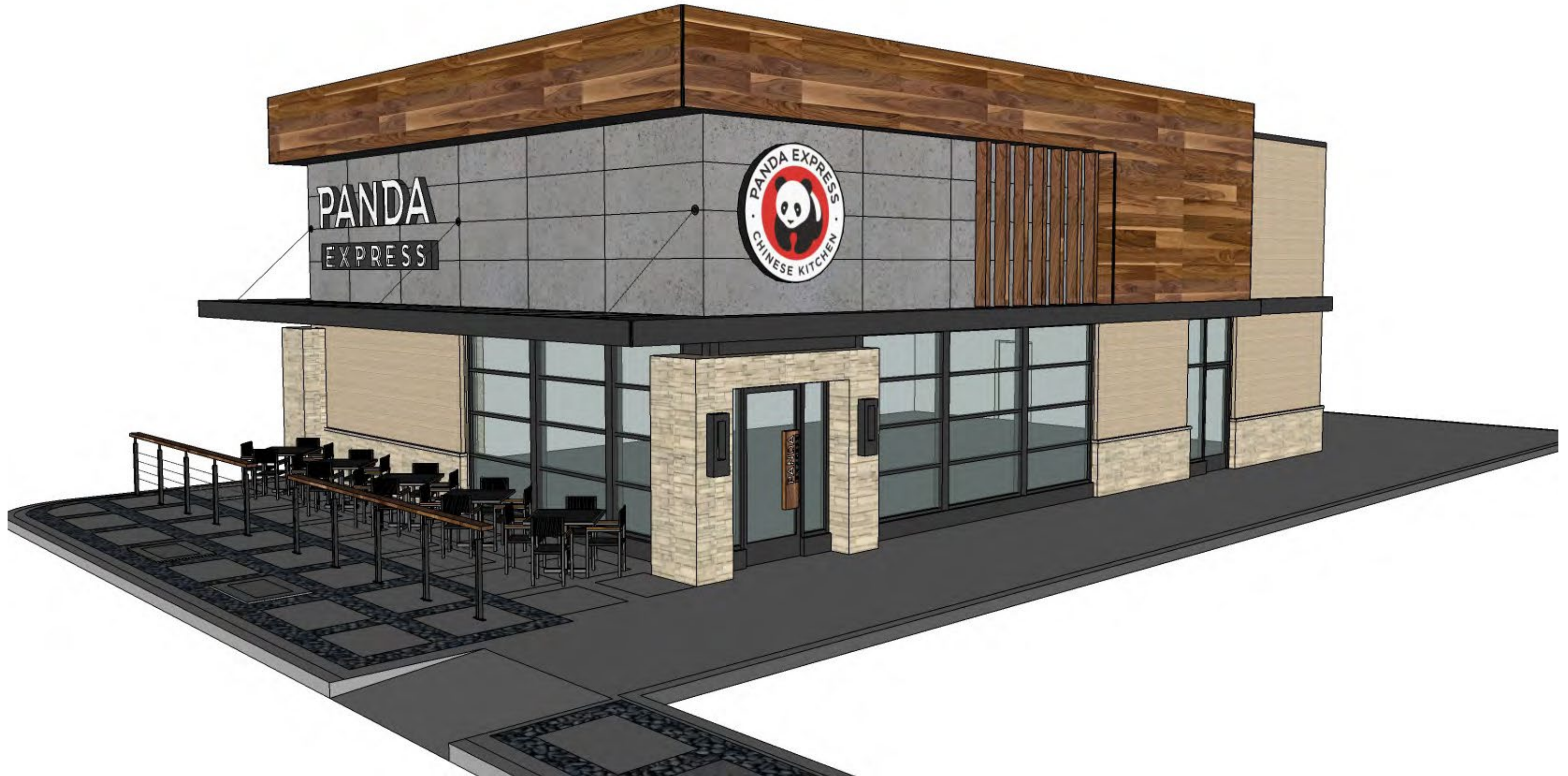
RENDER VIEW FACING SOUTHWEST