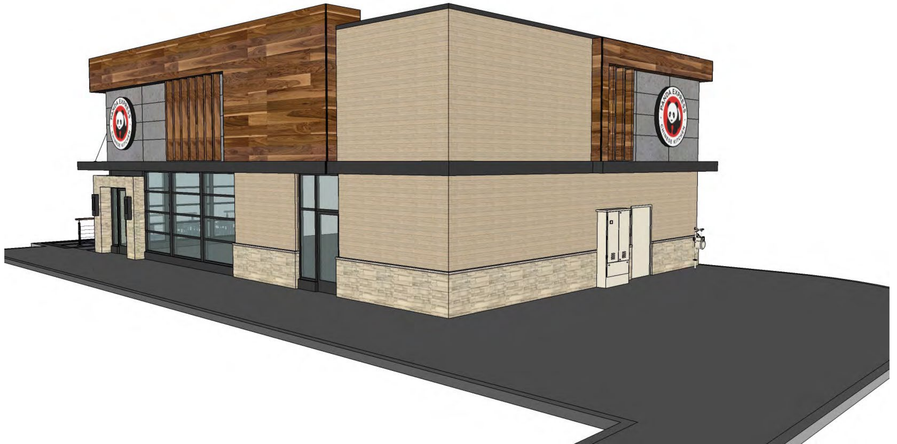
RENDER VIEW FACING SOUTHEAST