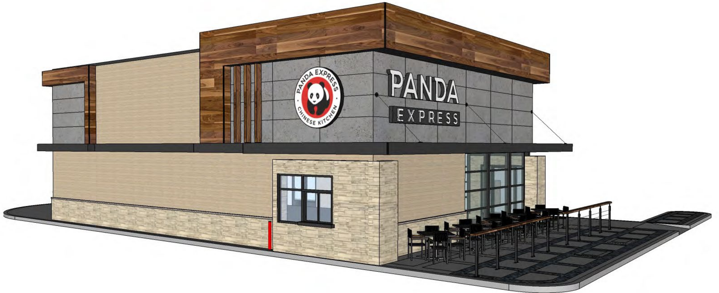
RENDER VIEW FACING NORTHWEST