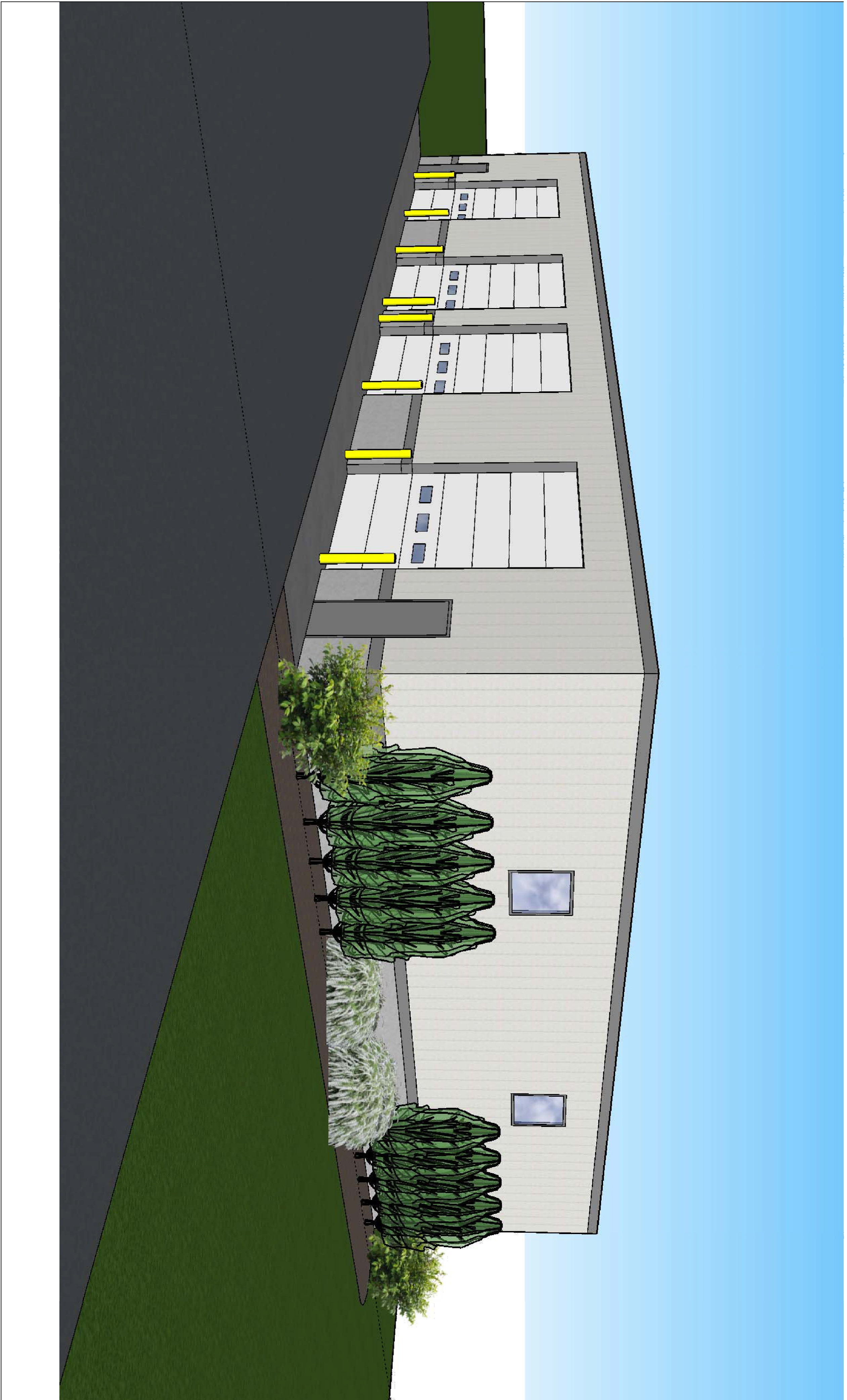
1 PERSPECTIVE A1.1 N.T.S.