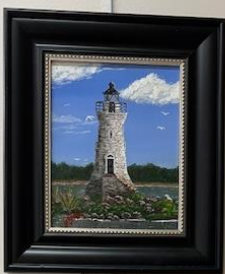
I Need Paint John Doe www.johndoe.com Contact: John Doe Address: 123 Main St City: Anytown, State: CA Phone: (555) 123-4567 Email: john.doe@johndoe.com