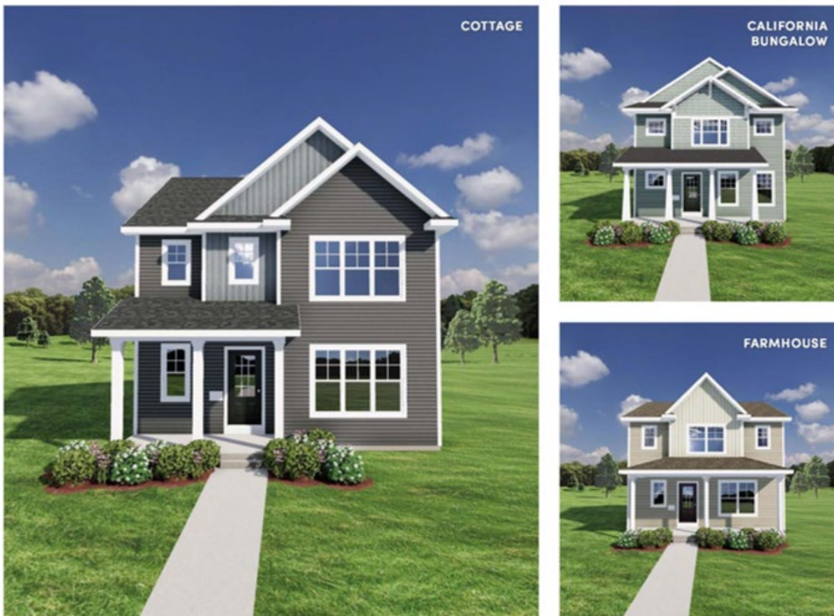
Figure 1 – Character Imagery of Carriage Lane Home Architecture

Carriage lane homes enhance the variety of housing and neighborhood character by incorporating single-family home sites served by alleys. By utilizing a rear facing garage, it allows for a similar size home on a narrower lot, which appeals to a variety of household types including, but not limited to, cost conscious new home buyers, those looking to attain home ownership without the demands of a large yard, or those looking to downsize into a smaller more manageable home. The alleys which serve the garages are proposed to be privately maintained and managed by a homeowner's association. The series of figures on the following pages articulate the design and functionality of these Carriage Lane homesites and the private alley configuration.