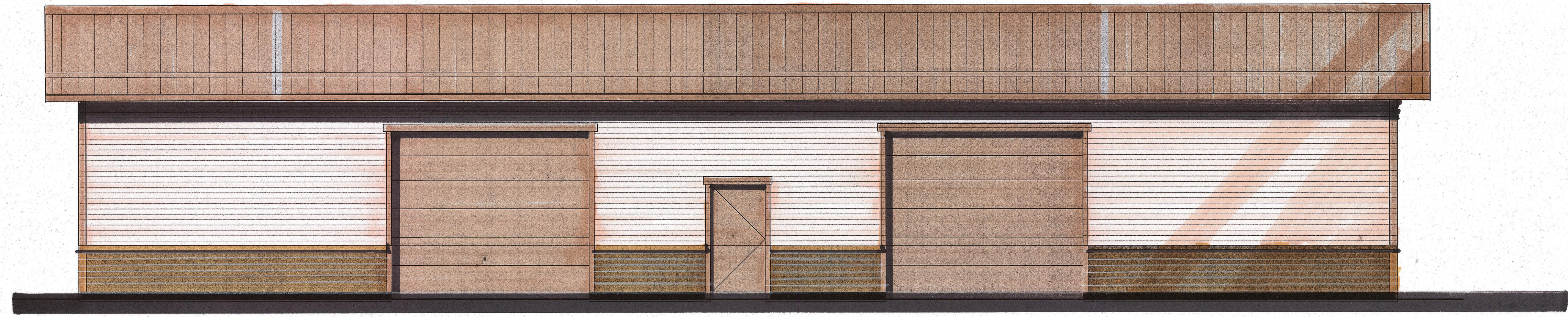
1 PROPOSED EAST ELEVATION

Project No.: 14.11 Date: 10/13/2014 Sheet No.: