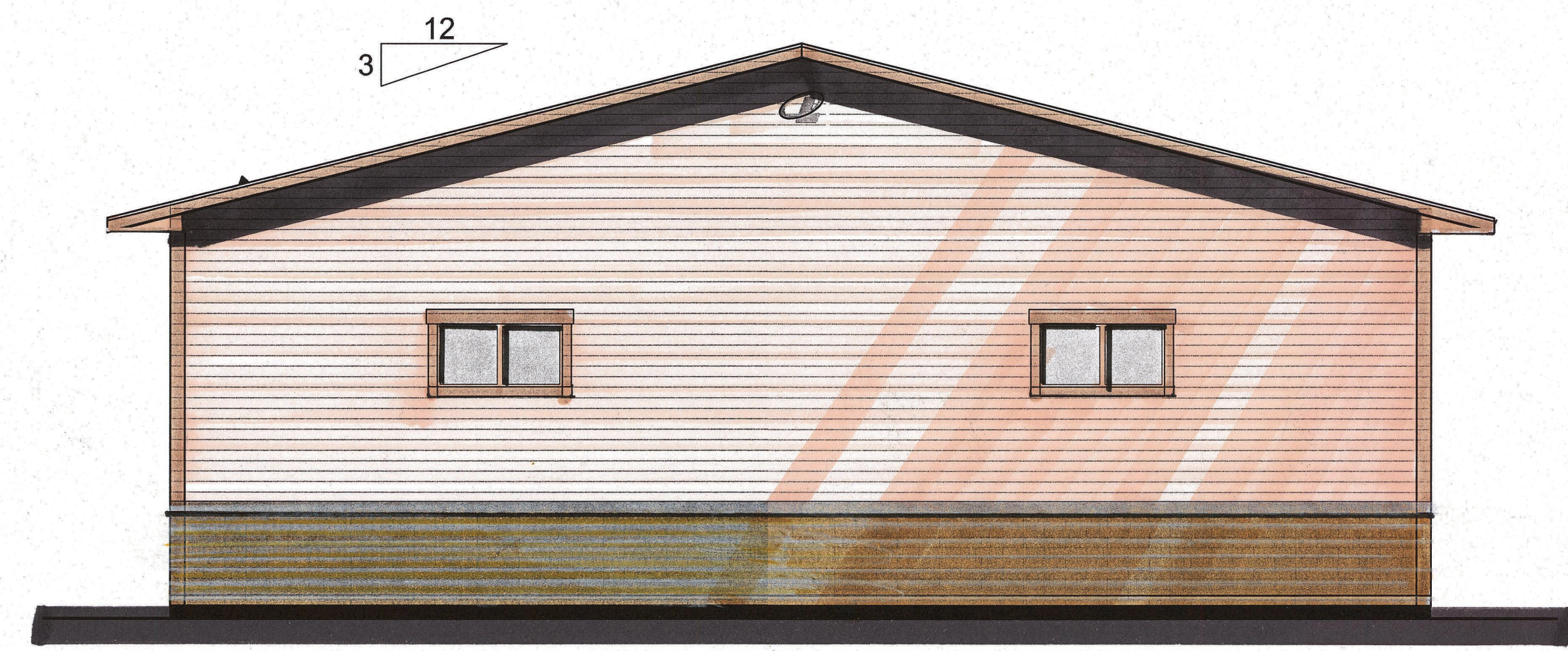
4 PROPOSED SOUTH ELEVATION