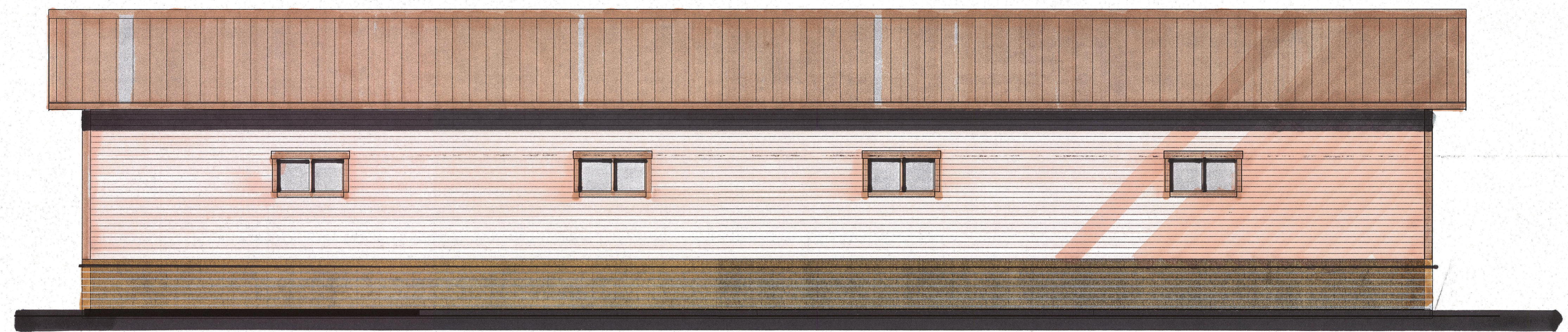
2 PROPOSED WEST ELEVATION