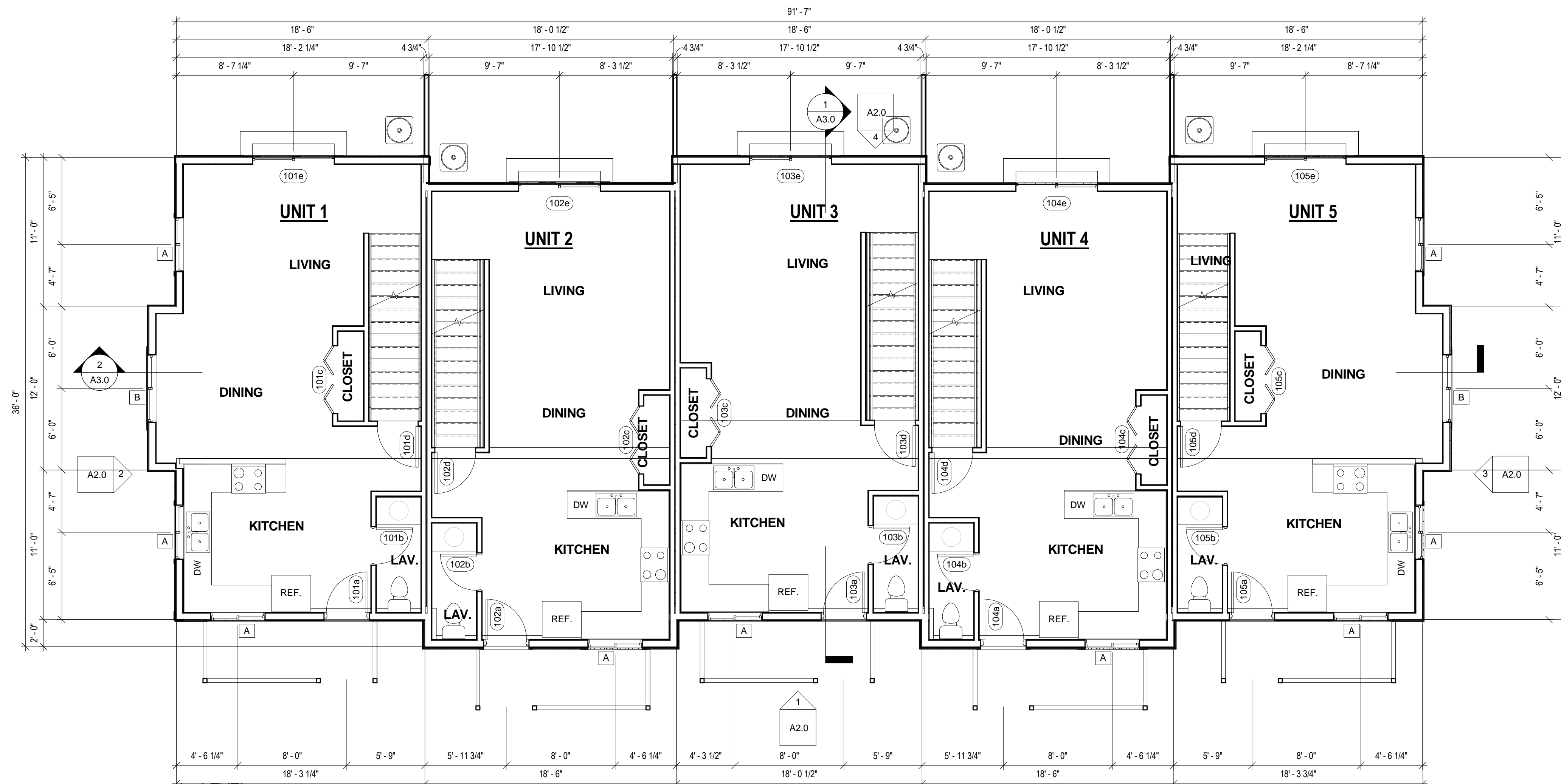
1 1st LEVEL 3/16" = 1'-0"