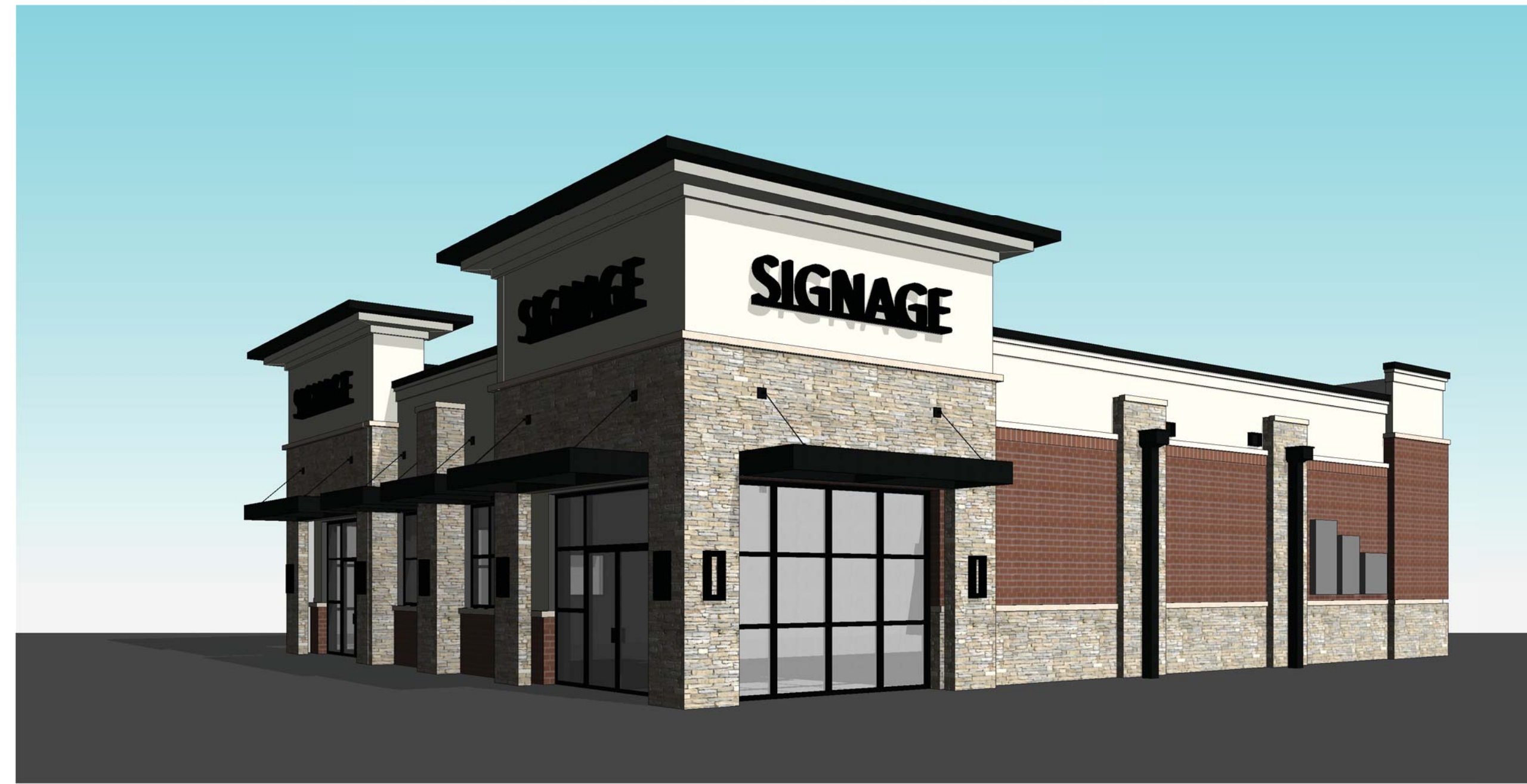
② 3D View 2