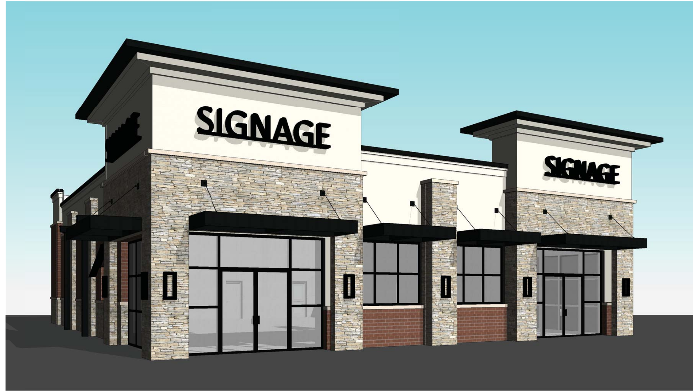
① 3D View 1