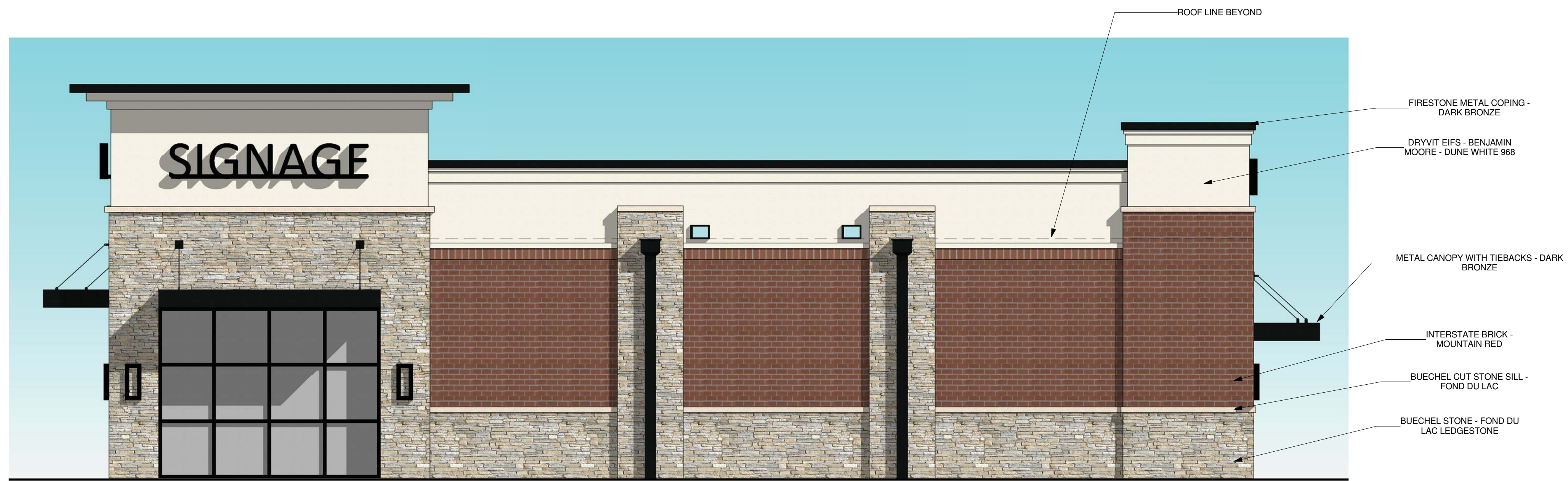
② HEARTLAND DENTAL NORTH ELEVATION 1/4" = 1'-0"