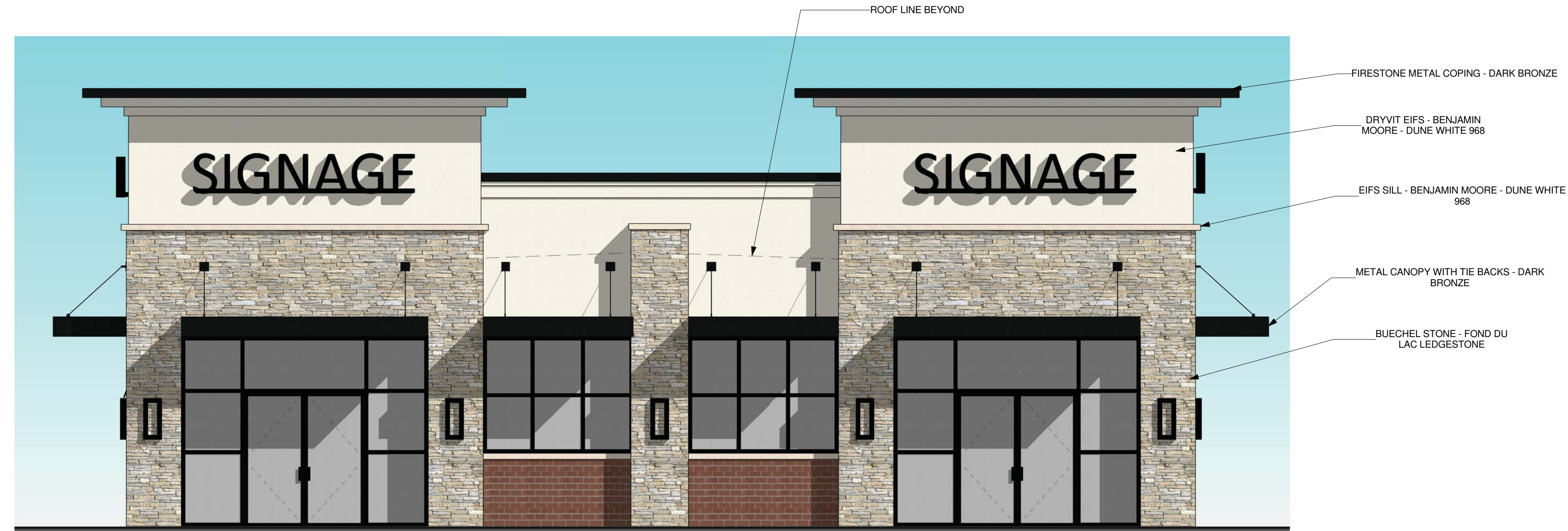
① HEARTLAND DENTAL EAST ELEVATION 1/4" = 1'-0"