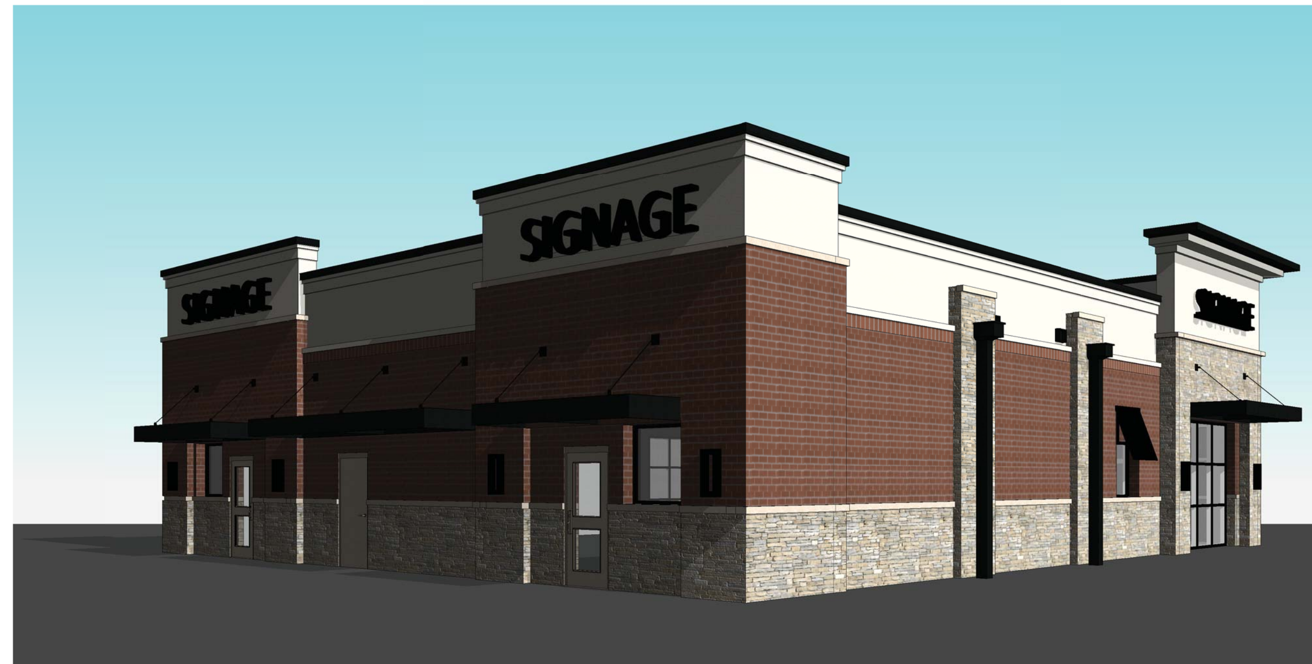
③ 3D View 3