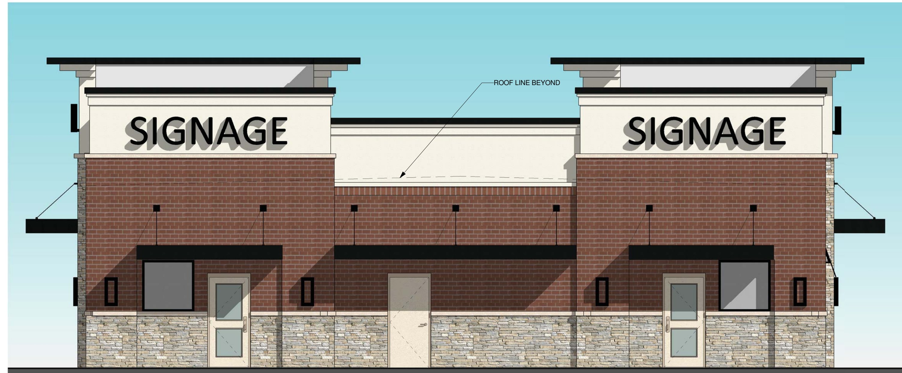
① HEARTLAND DENTAL WEST ELEVATION 1/4" = 1'-0"