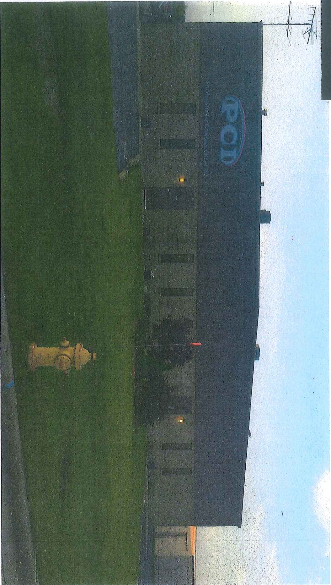
CURRENT FRONT ELEVATION