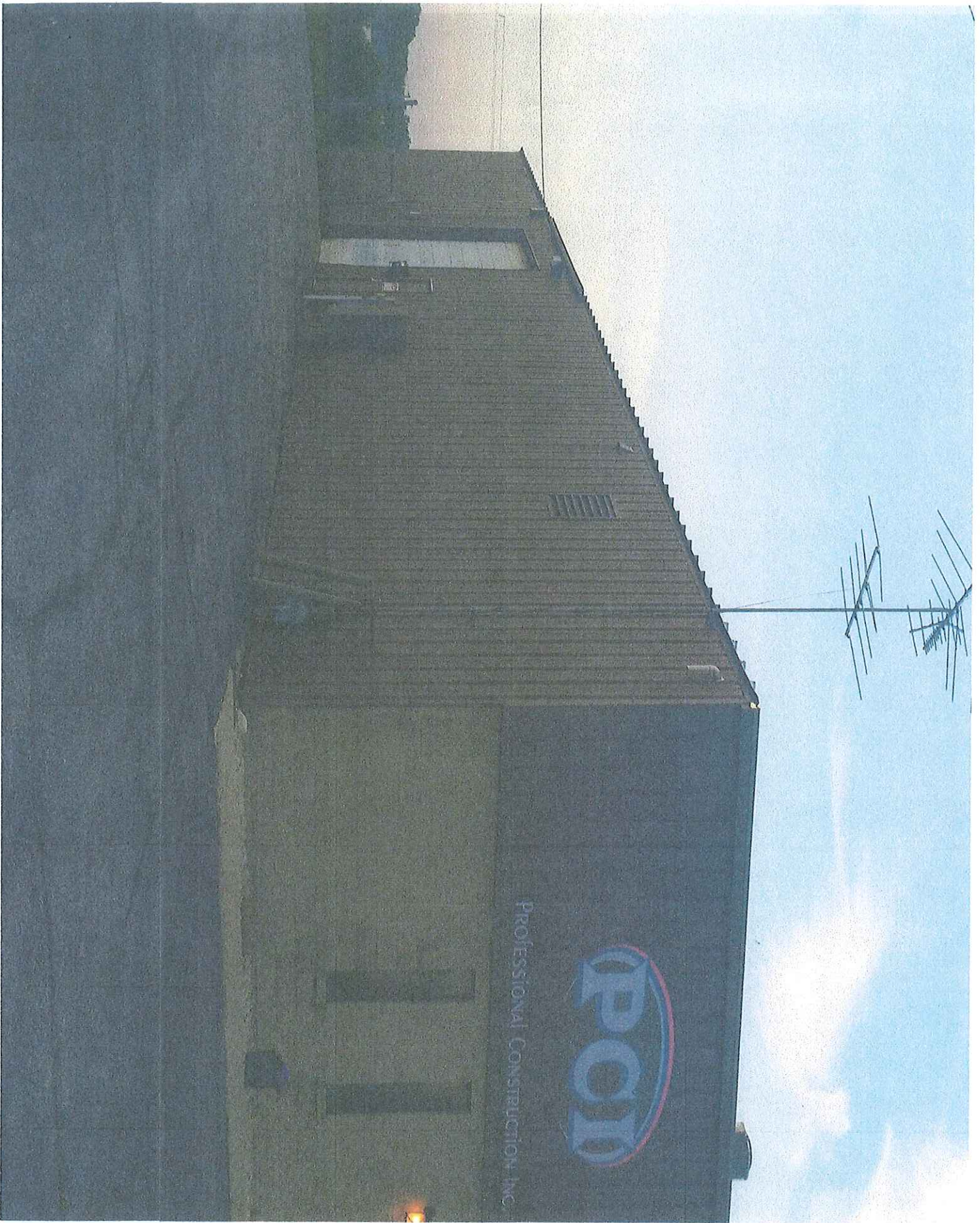
CURRENT WEST ELEVATION