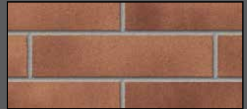
Delaware Blend Terracotta with Burgundy Flash