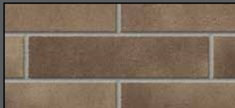
Gardner Blend Light Tan with Burgundy Flash