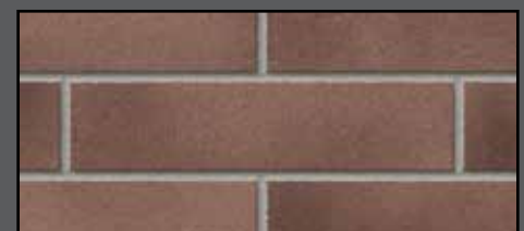
Syracuse Blend Light Brown with Burgundy Flash

The colors above are digital renderings of blended Spec-Brik colors. Due to the limitations of the printing process and the importance of viewing masonry materials under realistic site lighting conditions, we strongly recommend viewing a sample board before making color selections and using a jobsite sample panel as the basis for acceptance of the final work.