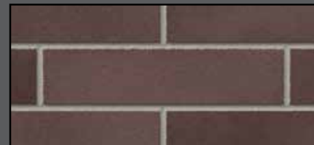
Panama City Blend Medium Brown with Burgundy Flash