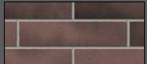
Houston Blend Brown with Black Flash