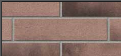
Jefferson City Blend Tan with Dark Brown/Black Flash