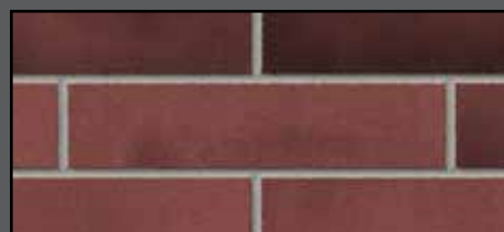
Stanton Blend Red with Black Flash