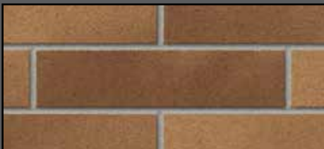
Dixon Blend Golden Tan with Burgundy Flash