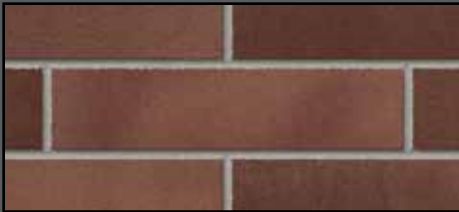
Birmingham Blend Orange-Brown with Burgundy Flash

Check concreteproductsgroup.com for Downloadable Masonry Designer Rendering Software