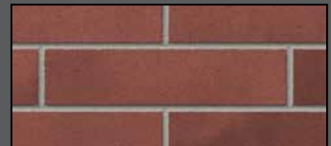
Philadelphia Blend Red with Light Burgundy Flash