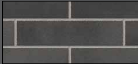
Chesapeake Blend Dark Gray with Black Flash