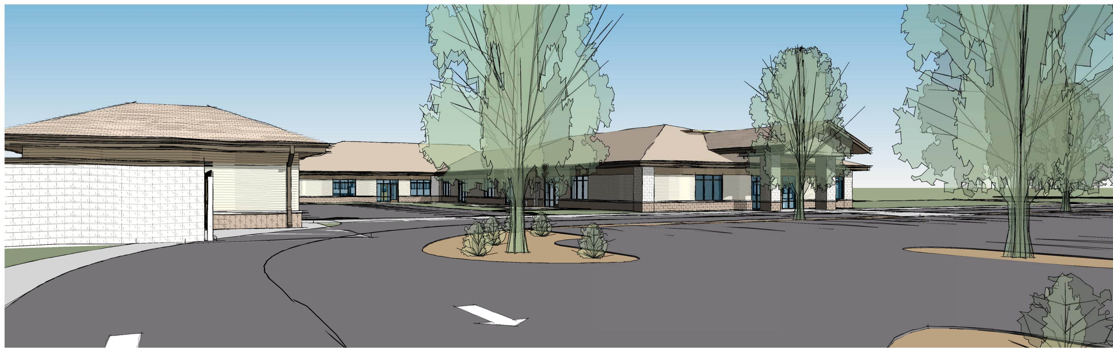
parking lot view from north