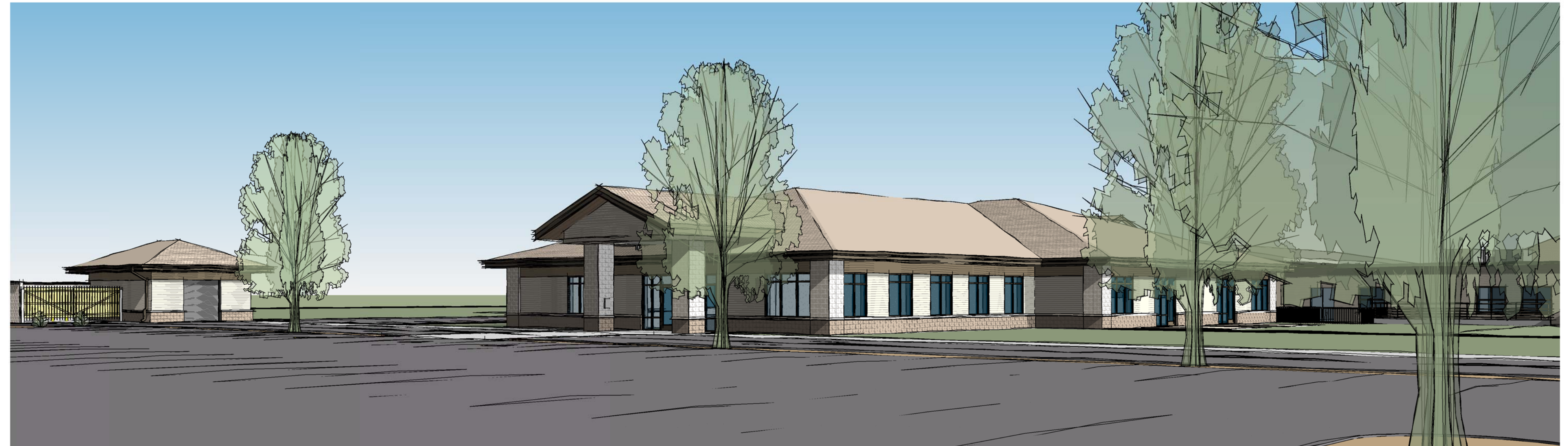
PARKING LOT VIEW FROM SOUTH