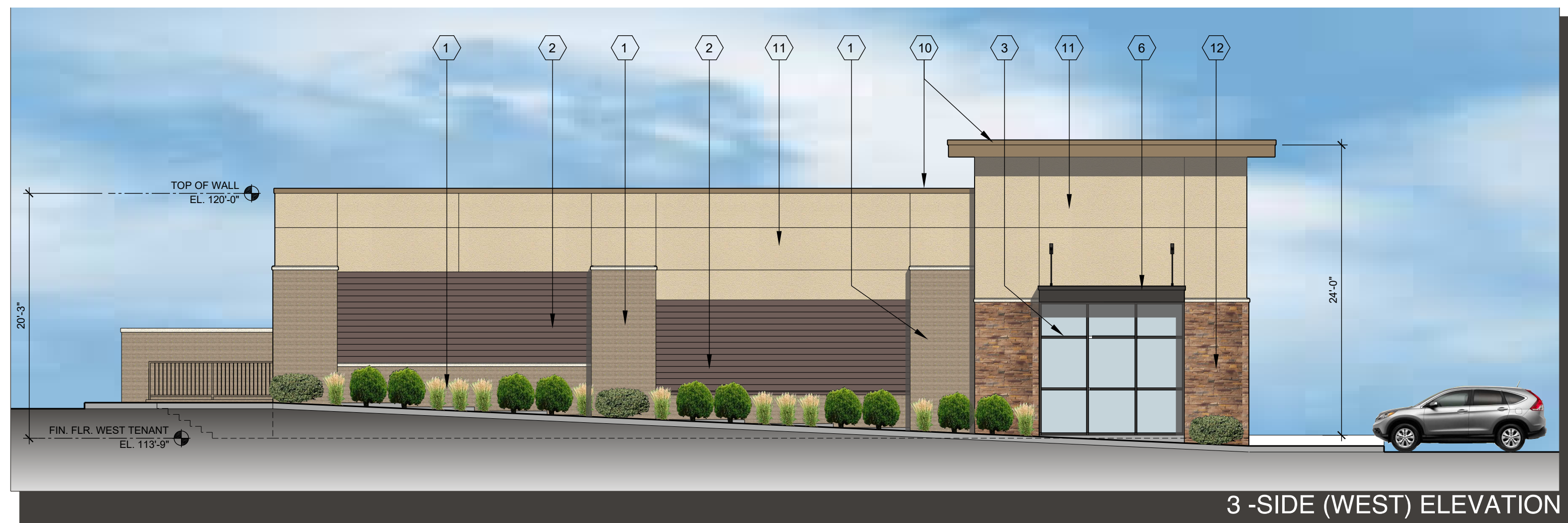
3 -SIDE (WEST) ELEVATION