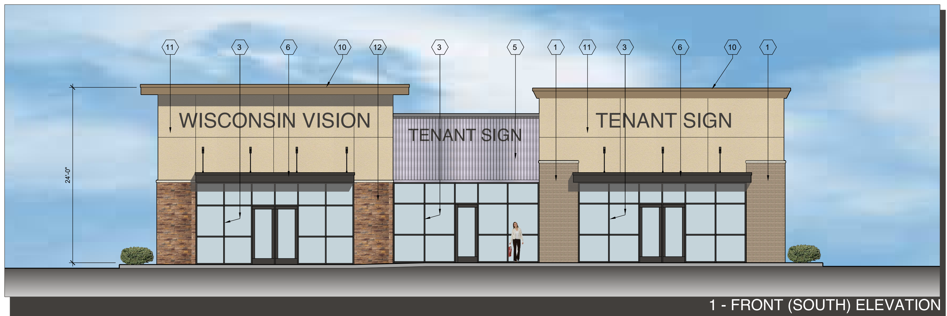
1 - FRONT (SOUTH) ELEVATION