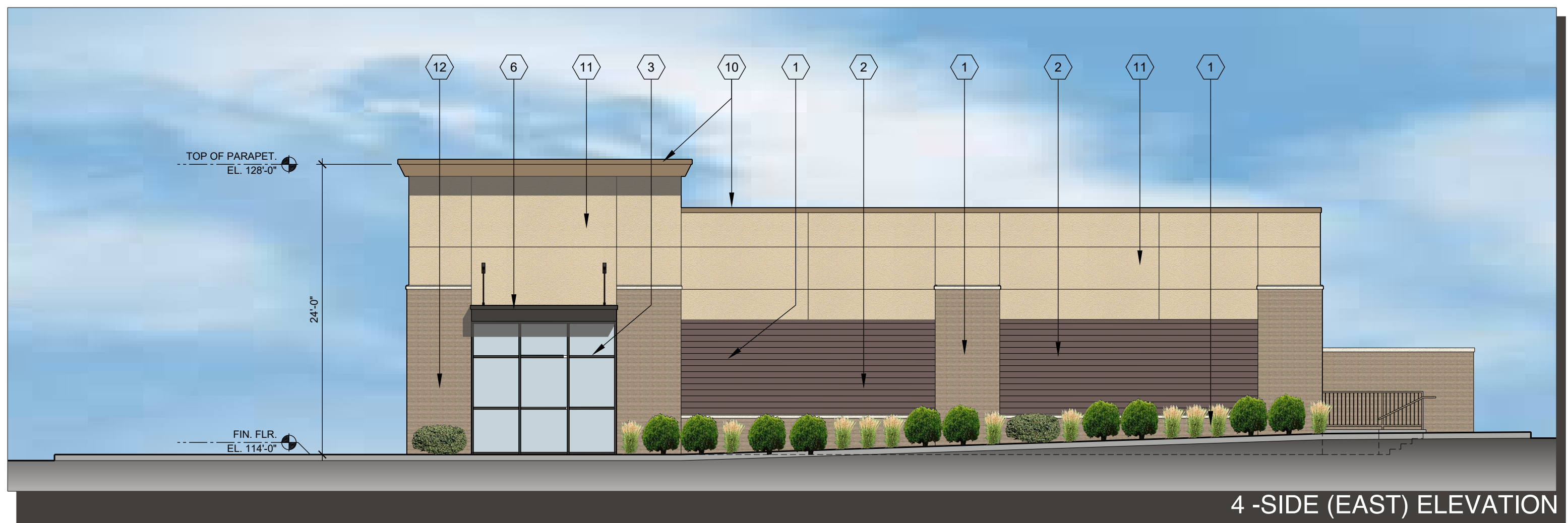
4 -SIDE (EAST) ELEVATION