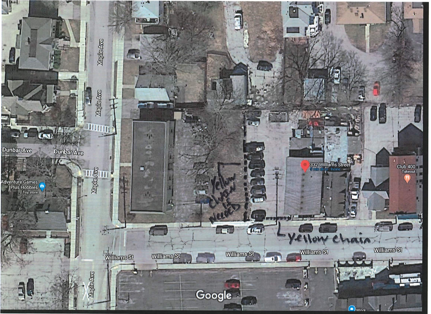
Imagery ©2020 U.S. Geological Survey, Map data ©2020 20 ft