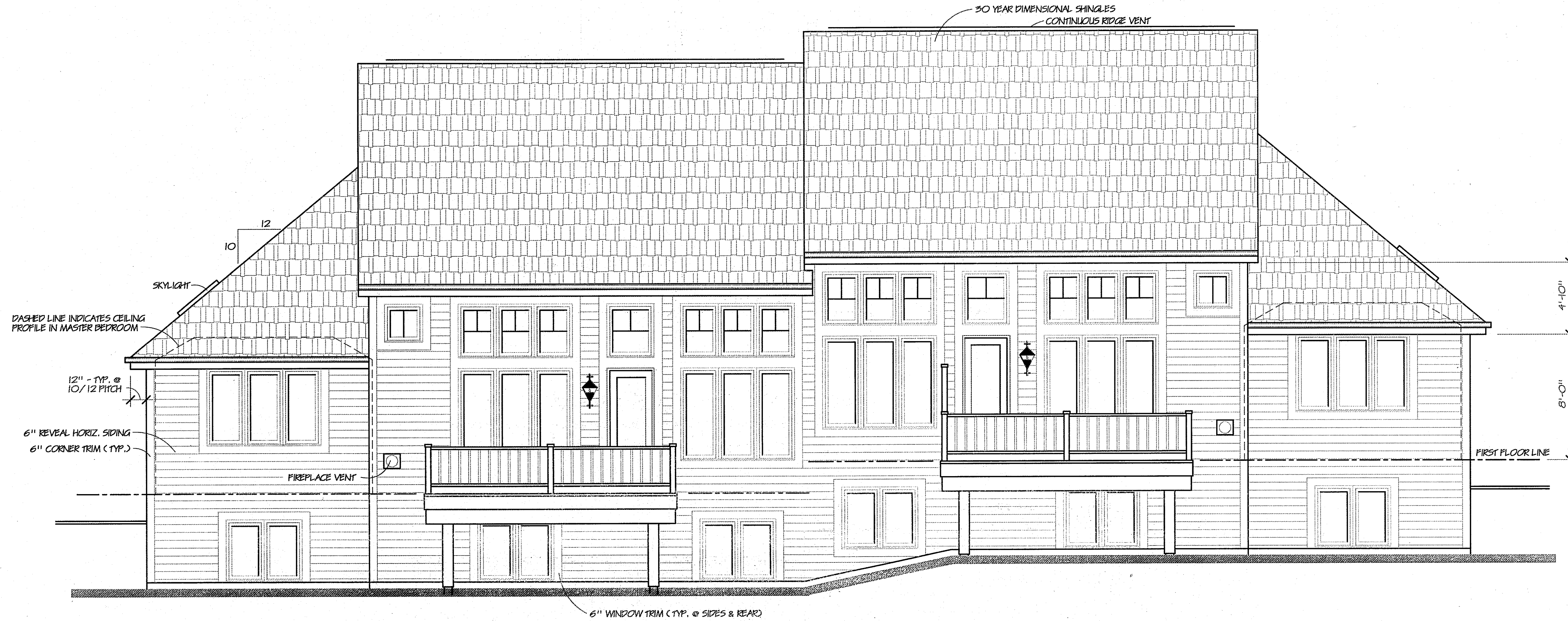
REAR ELEVATION SCALE 1/4" = 1'-0" * 9'-0" FIRST FLOOR *