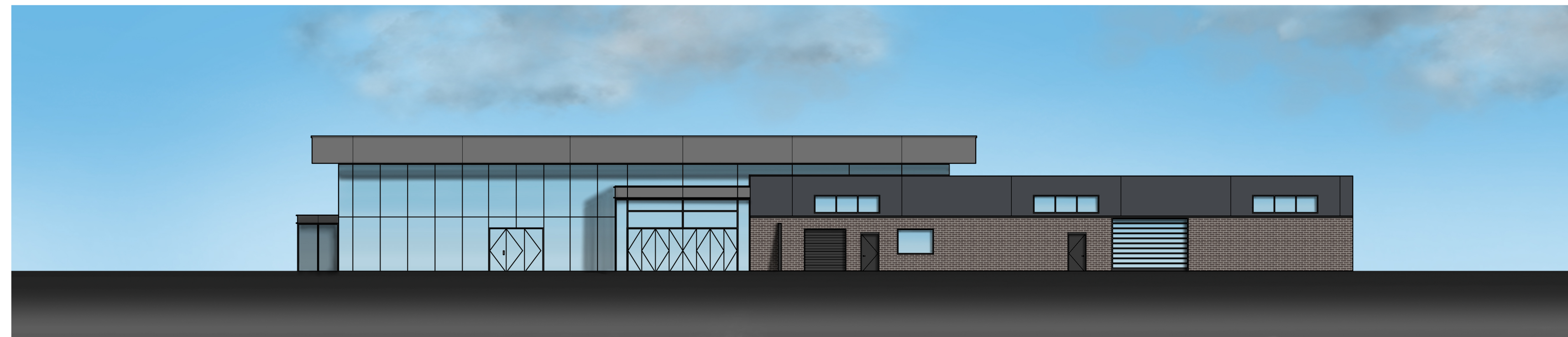
EAST ELEVATION 1/8" = 1'-0"