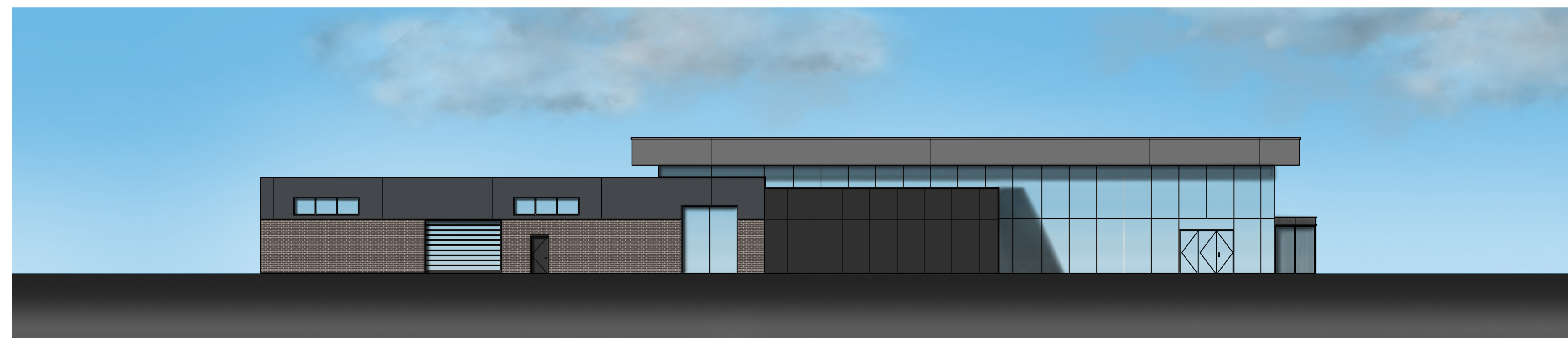
WEST ELEVATION 1/8" = 1'-0"