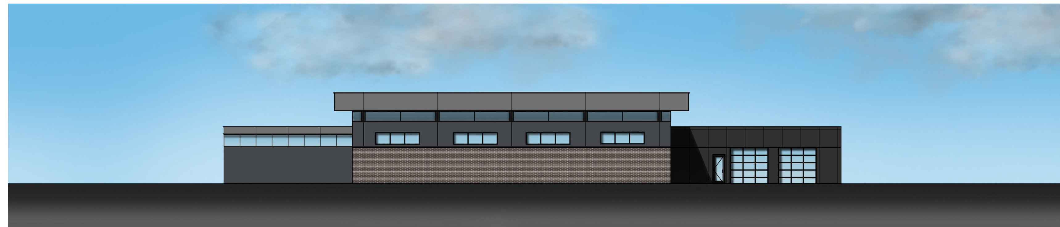
SOUTH ELEVATION 1/8" = 1'-0"