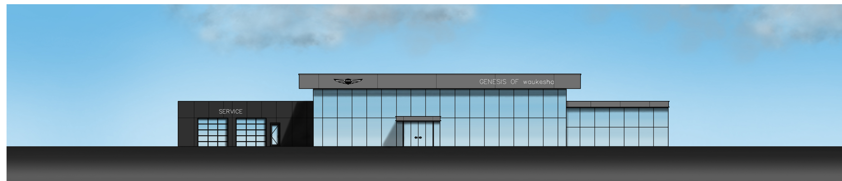
NORTH ELEVATION 1/8" = 1'-0"