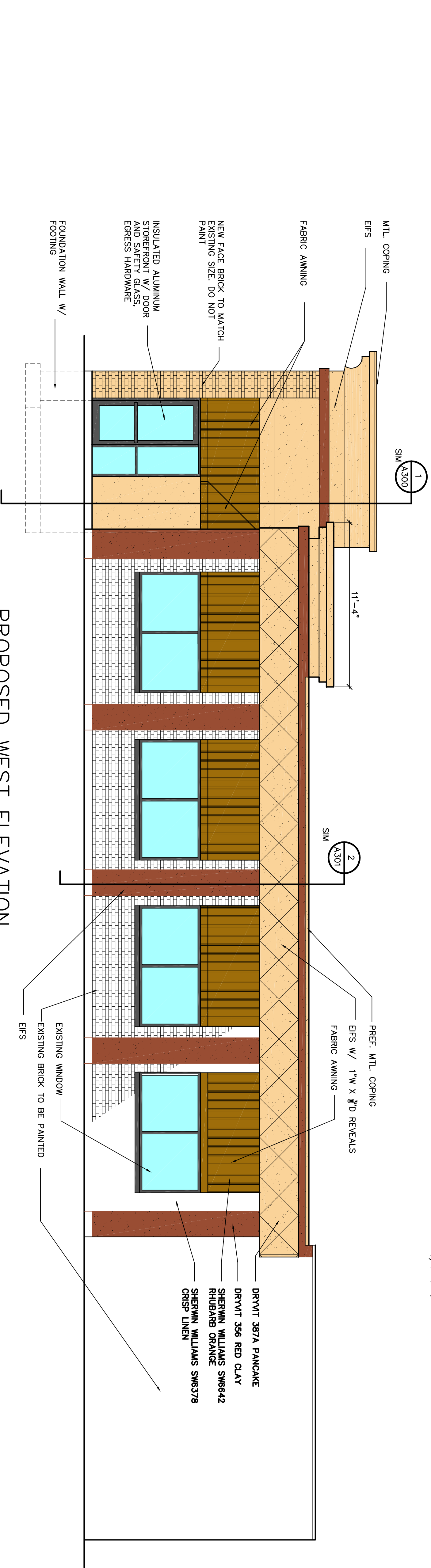
PROPOSED WEST ELEVATION 1/4"=1'-0"