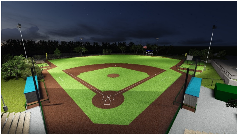
Reviewed and Approved March 2021: WPRF Board