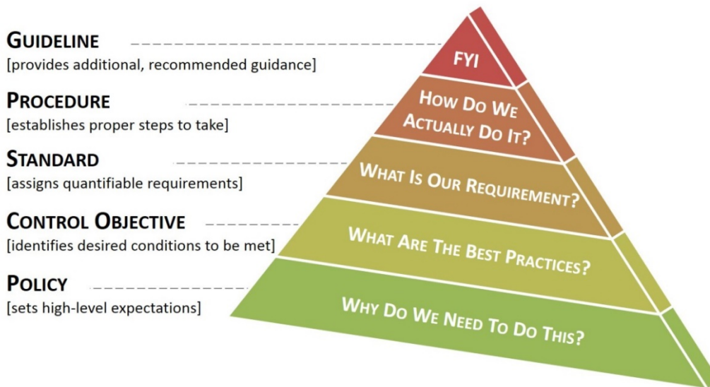
Figure 1: Policy Framework