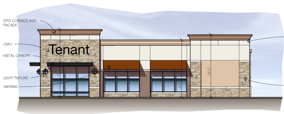
BUILDING F NORTH ELEVATION SCALE: 3/32"=1'-0" 4 A4.4