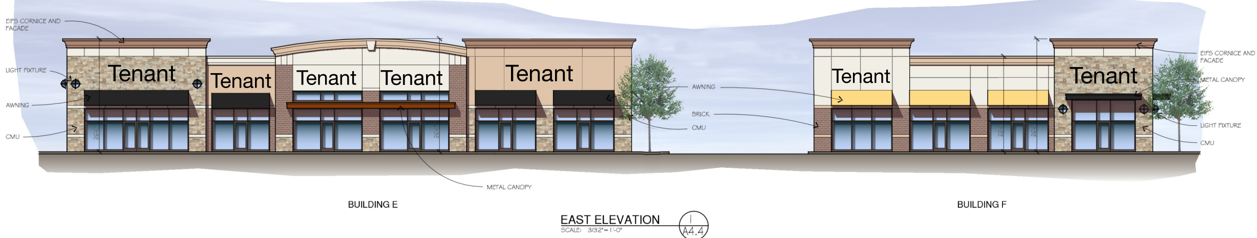
EAST ELEVATION SCALE: 3/32"=1'-0" 1 A4.4