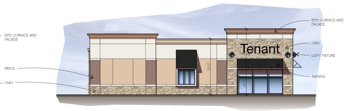
BUILDING E SOUTH ELEVATION SCALE: 3/32"=1'-0" 3 A4.4