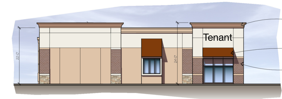
BUILDING F SOUTH ELEVATION SCALE: 3/32"=1'-0" 6 A4.4