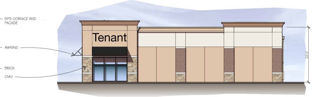
BUILDING E NORTH ELEVATION SCALE: 3/32"=1'-0" 5 A4.4