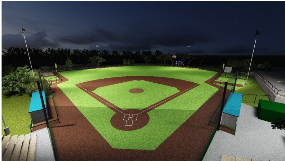
Reviewed and Approved September 2021 : WPRF Board