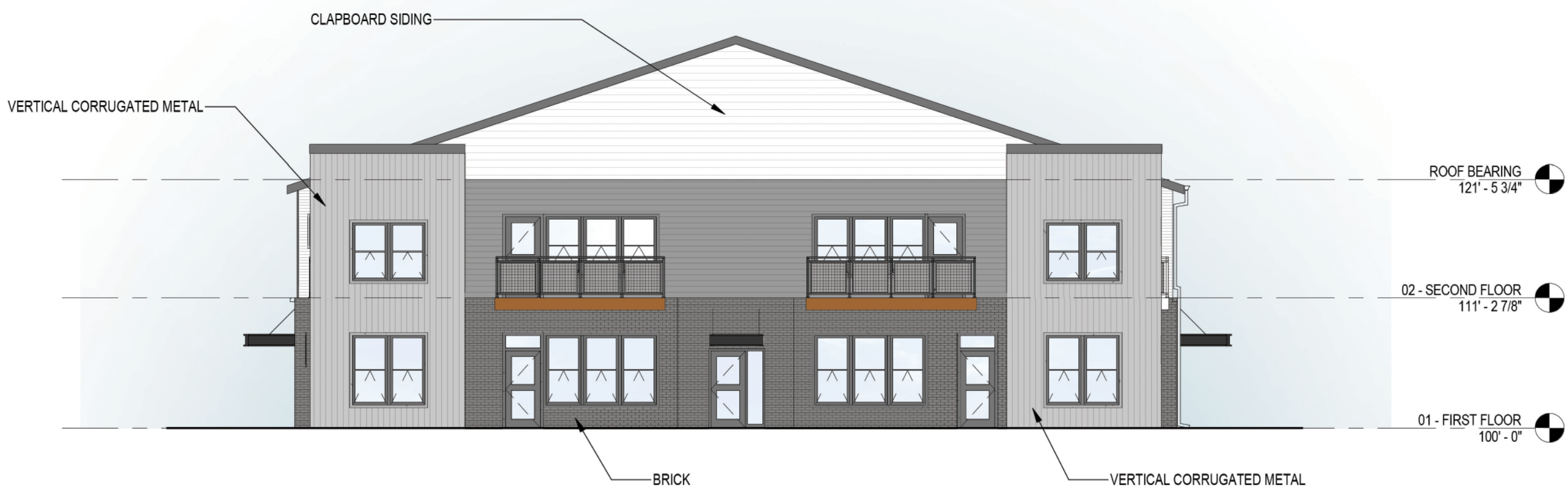
4 WEST ELEVATION 1" = 10'-0"