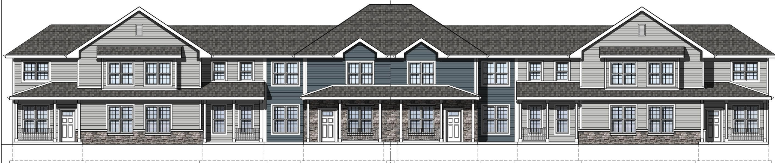
SOUTHEAST ELEVATION 3/16" = 1'-0"