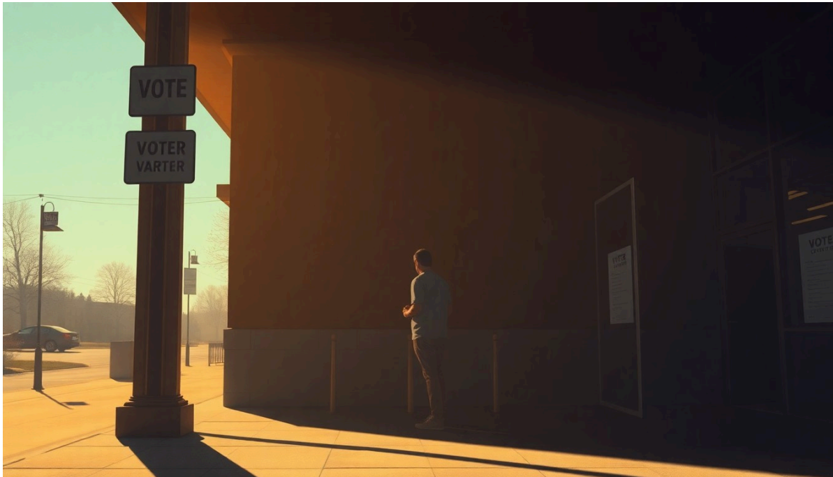
Voters in Waukesha, Wisconsin wait patiently in line to cast their ballots on Election Day, reflecting the community's strong civic engagement.

Voters in Waukesha, Wisconsin headed to the polls on Election Day, with long lines forming outside the Waukesha Public Library as early as 6:50 a.m. Over 700 ballots had been cast by 11 a.m., with residents citing the mayoral race and the open seat on the Wisconsin Supreme Court as key issues driving them to vote.