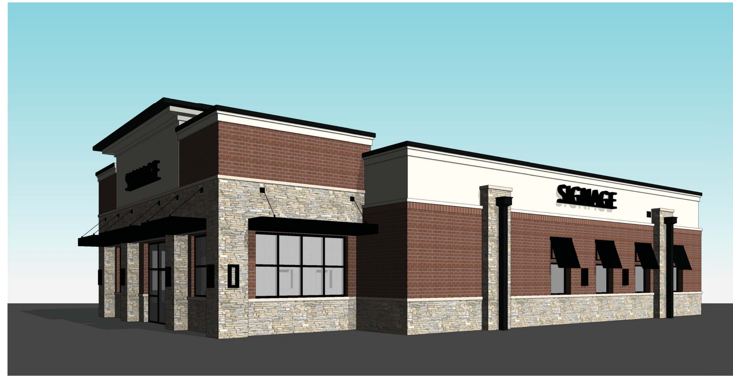
② 3D View 2