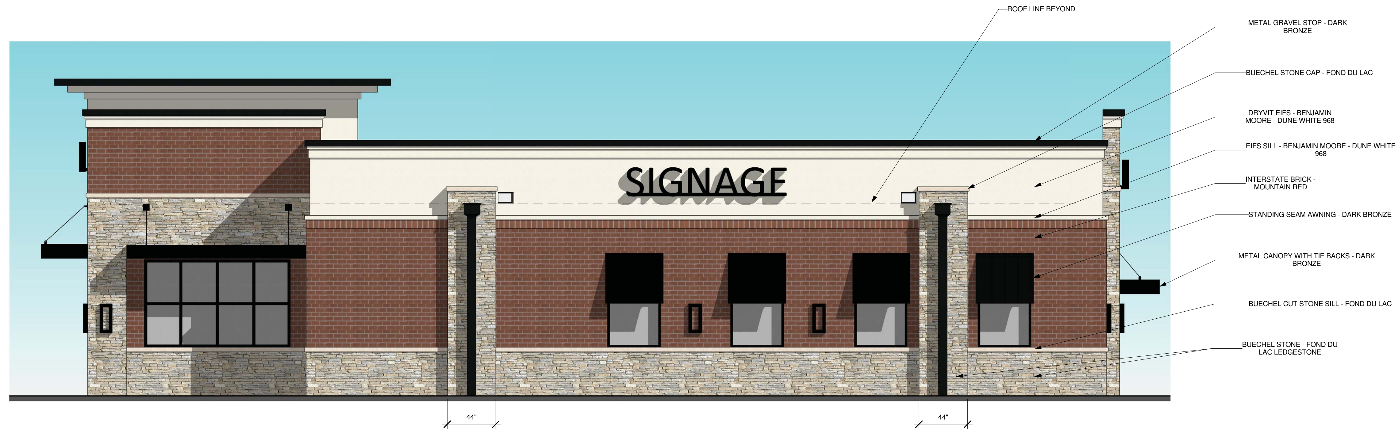
② HEARTLAND DENTAL NORTH ELEVATION 1/4" = 1'-0"