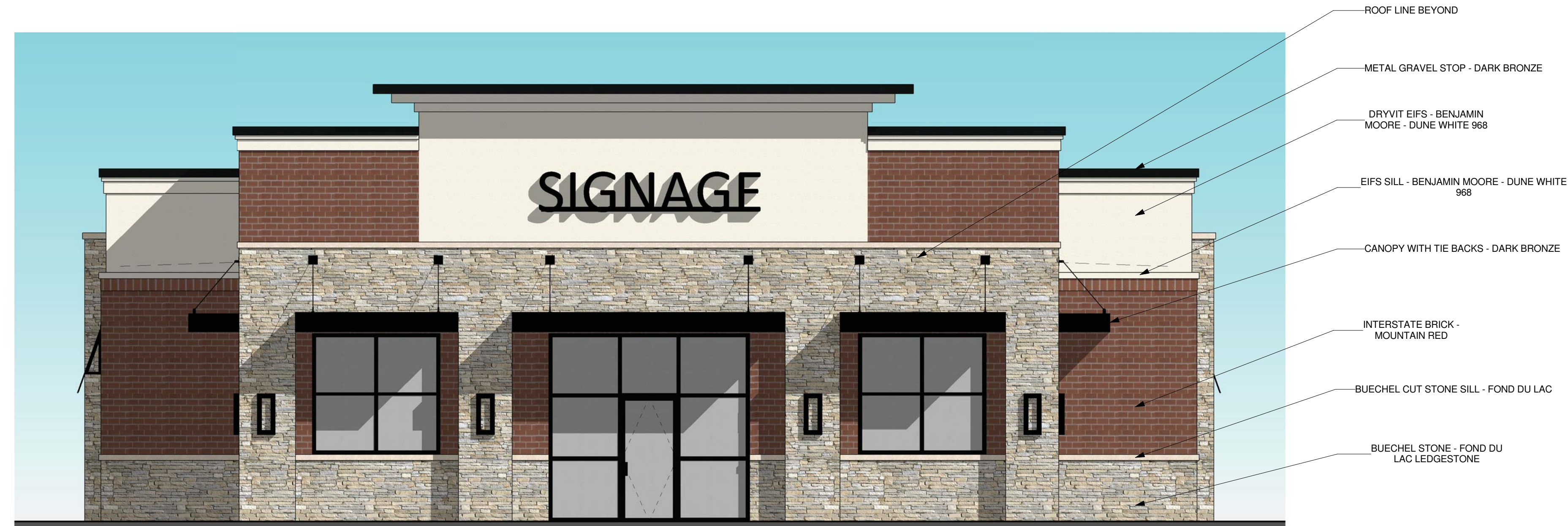
① HEARTLAND DENTAL EAST ELEVATION 1/4" = 1'-0"