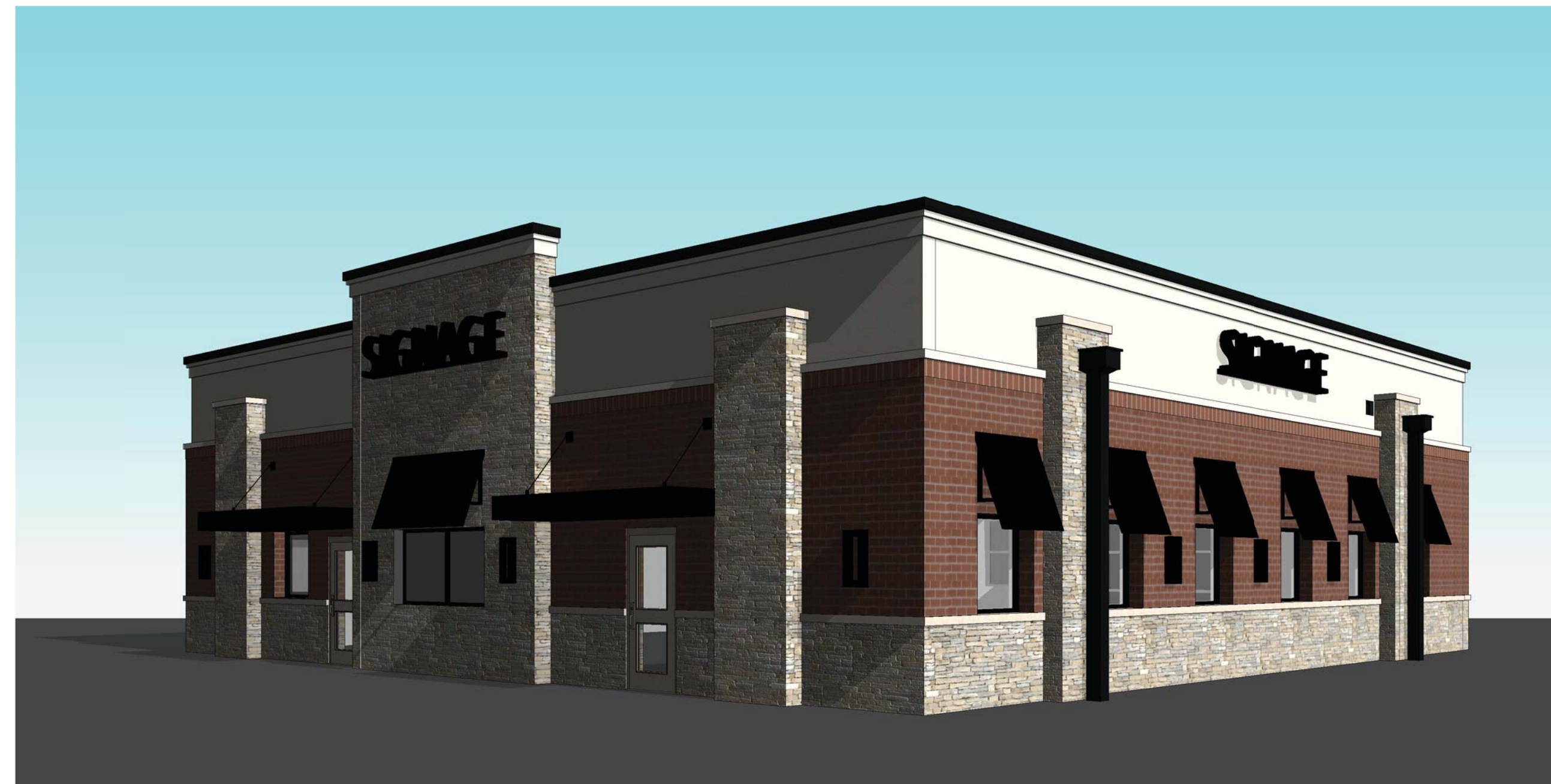
③ 3D View 3