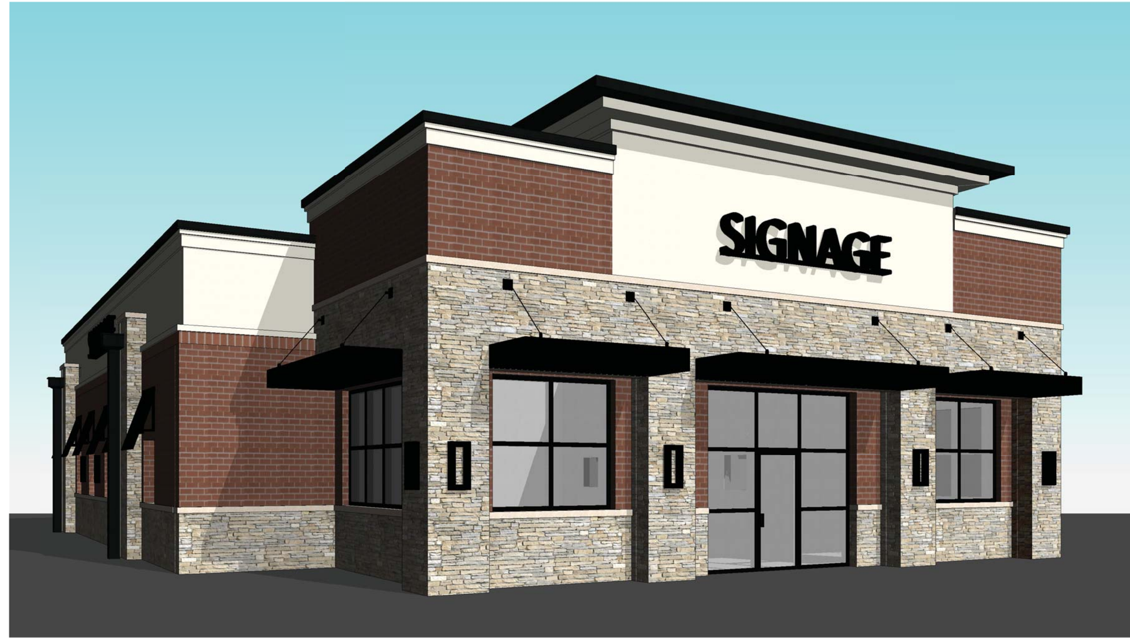
① 3D View 1