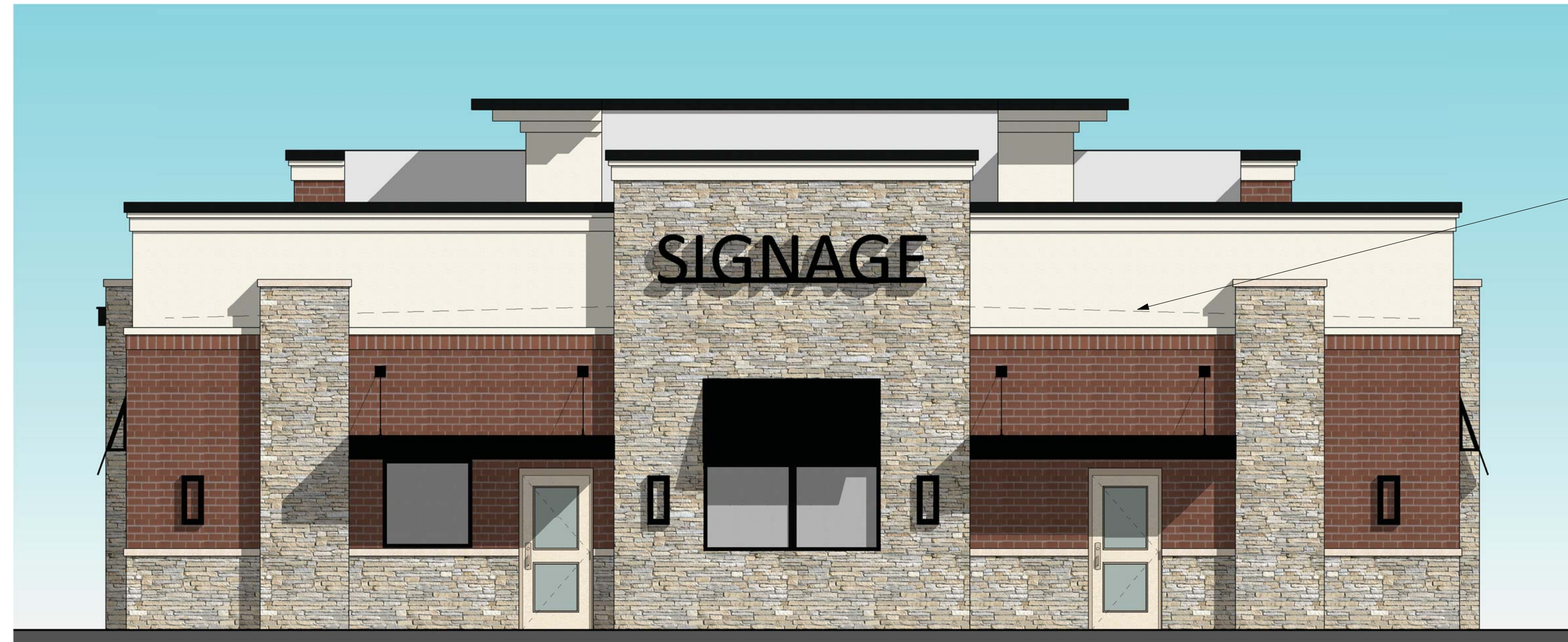
① HEARTLAND DENTAL WEST ELEVATION 1/4" = 1'-0"