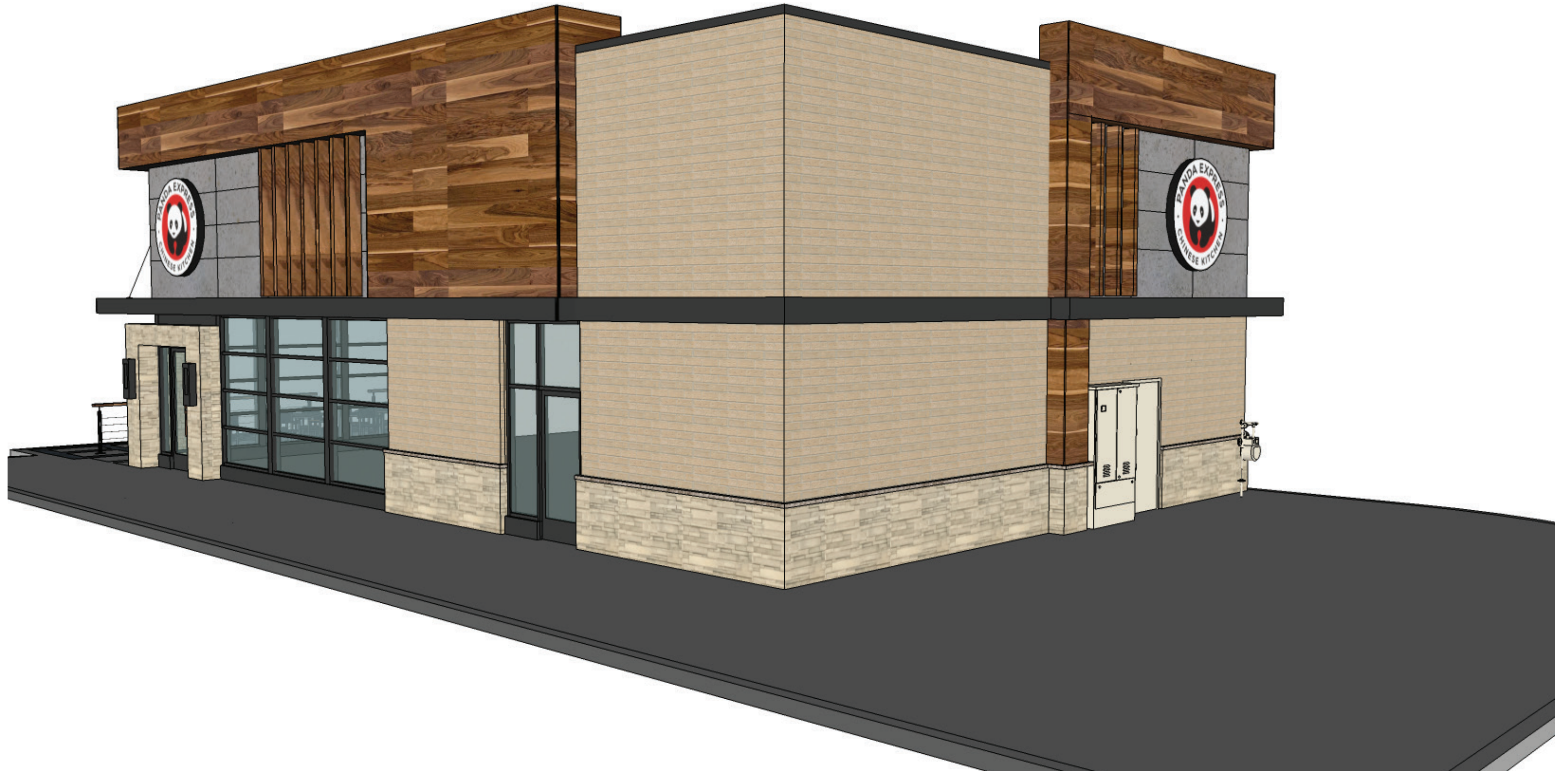
RENDER VIEW FACING SOUTHEAST