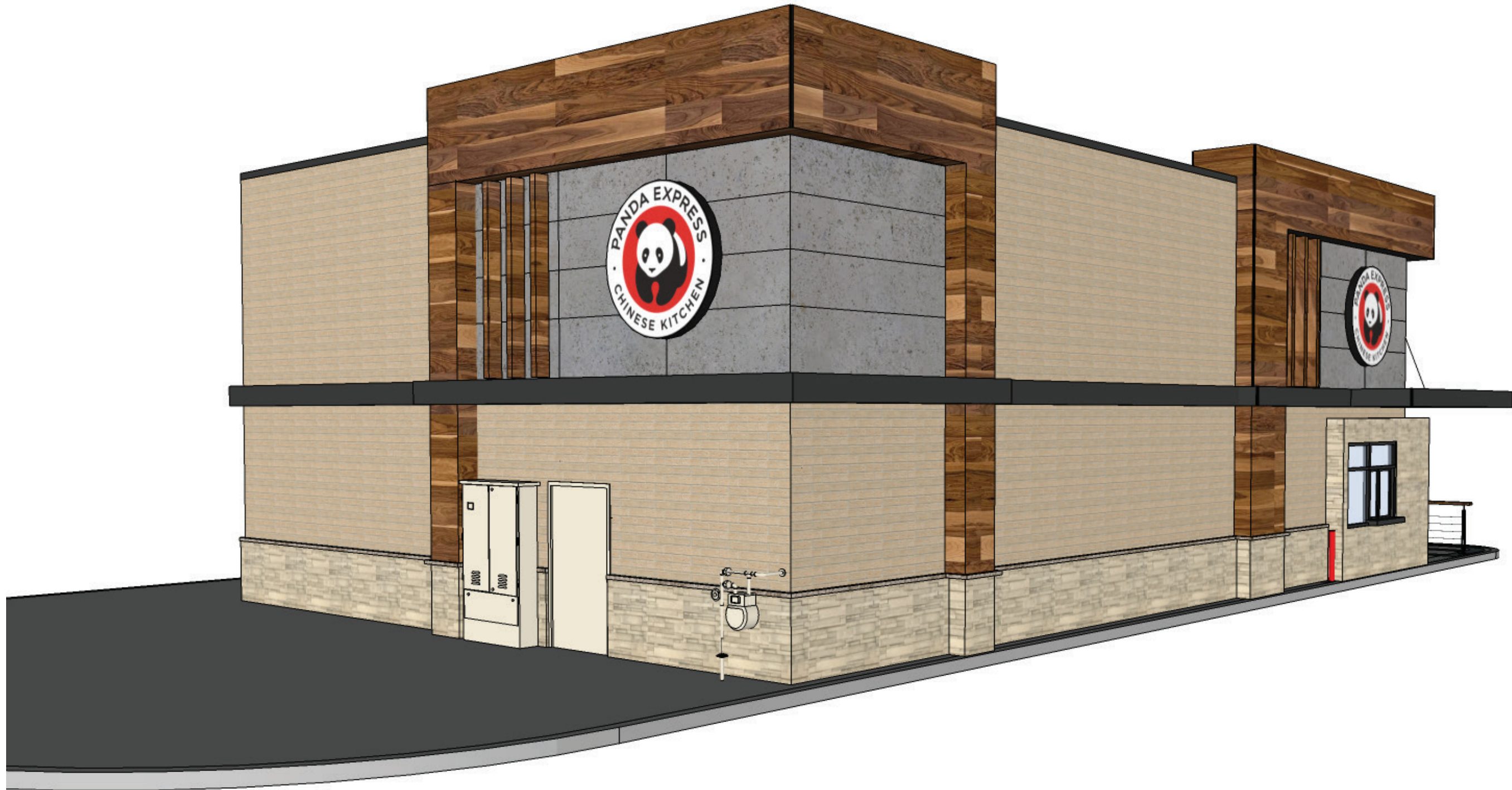
RENDER VIEW FACING NORTHEAST