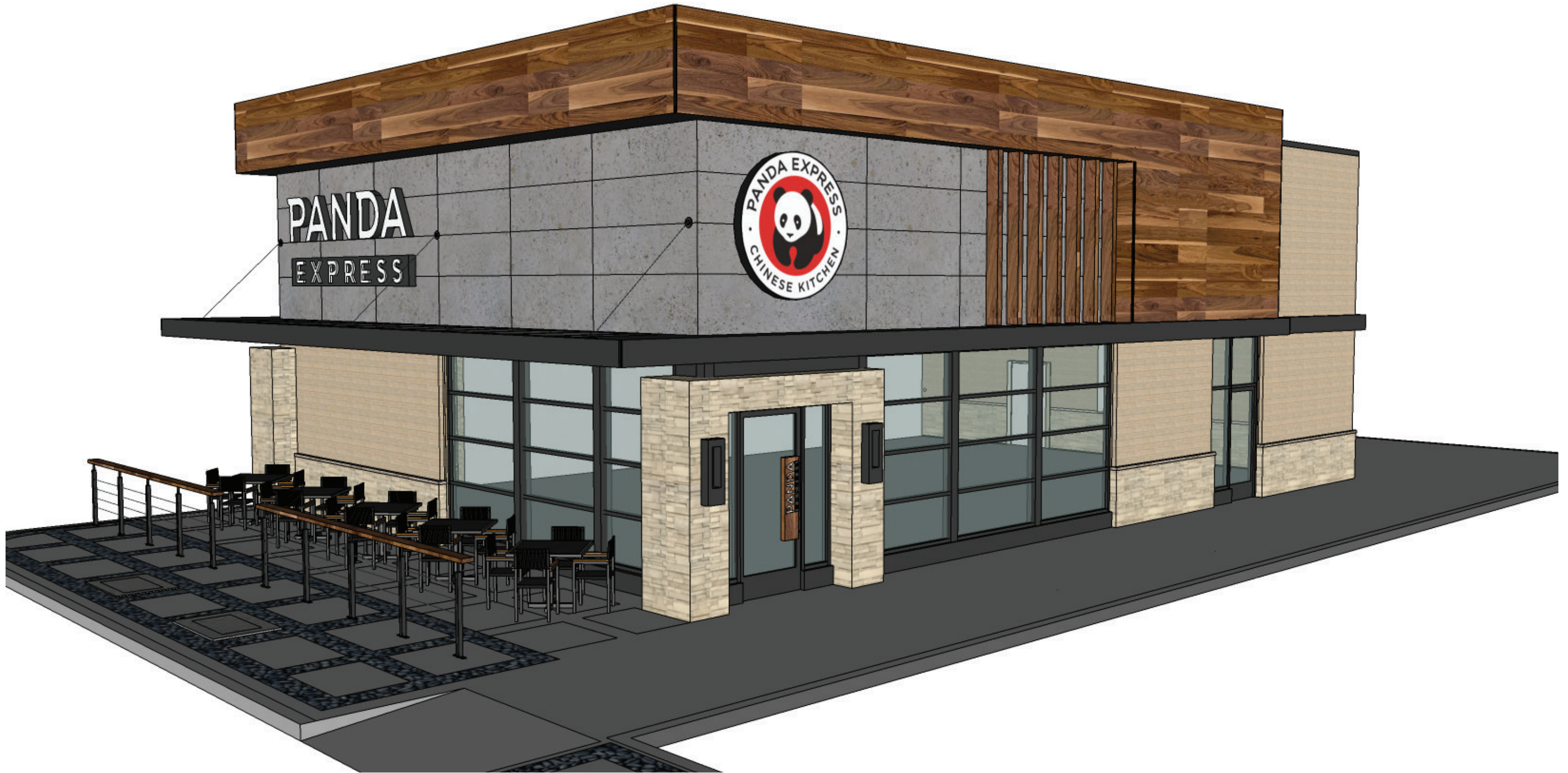
RENDER VIEW FACING SOUTHWEST