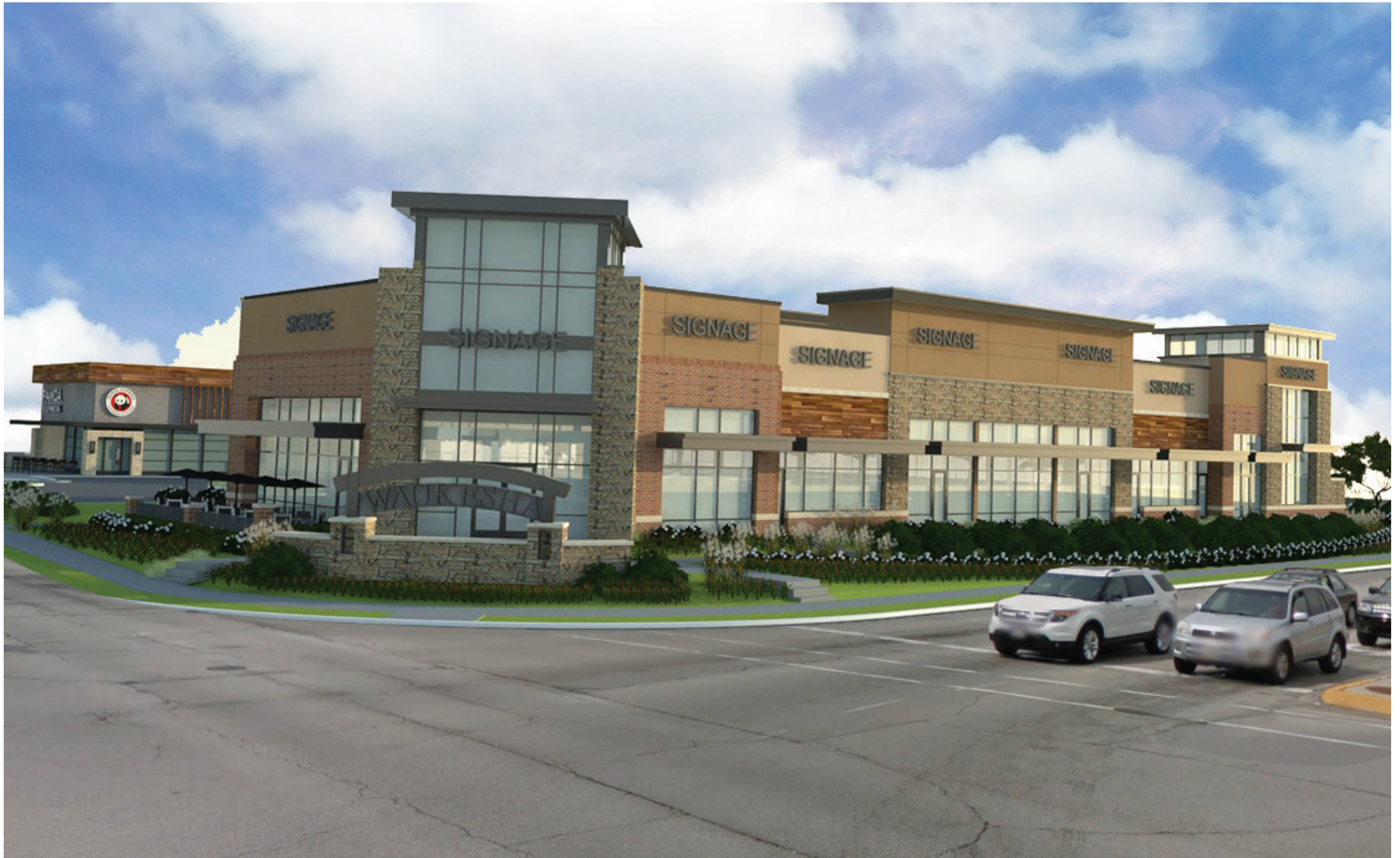
NORTHEAST VIEW FROM GRANDVIEW RD