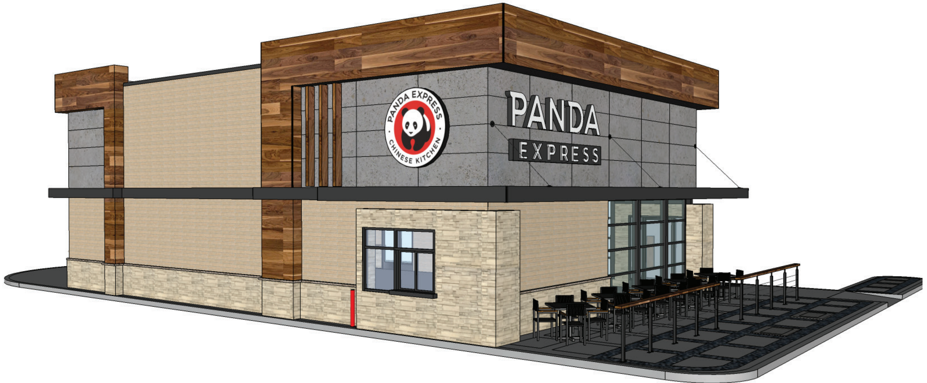
RENDER VIEW FACING NORTHWEST